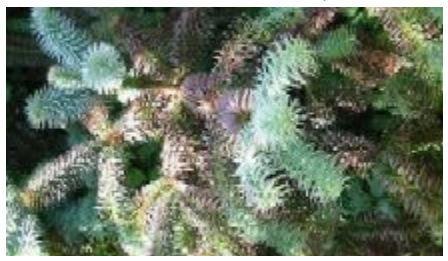
Foliage at Strybing Arboretum, Golden Gate Park, San Francisco, CA. (J.S. Peterson @ USDA-NRCS PLANTS Database)

foliage at Strybing Arboretum, Golden Gate Park, San Francisco, CA. (J.S. Peterson @ USDA-NRCS PLANTS Database)