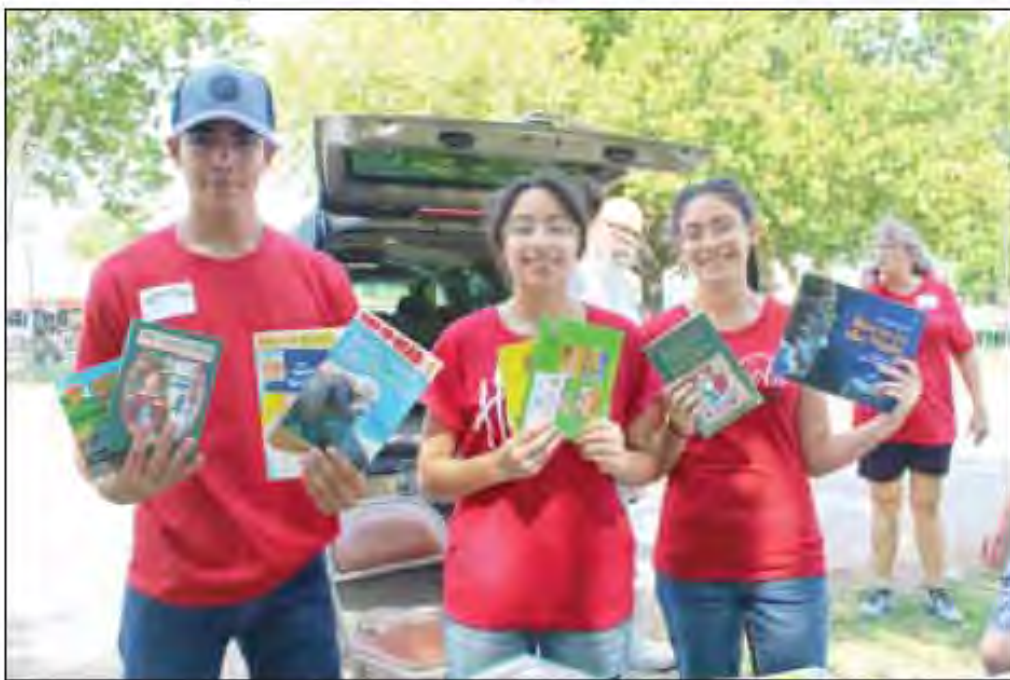
Books purchased by the Cotton Electric Charitable Foundation were handed out by the Duncan Area Literacy Council during Fiesta at Fuqua.