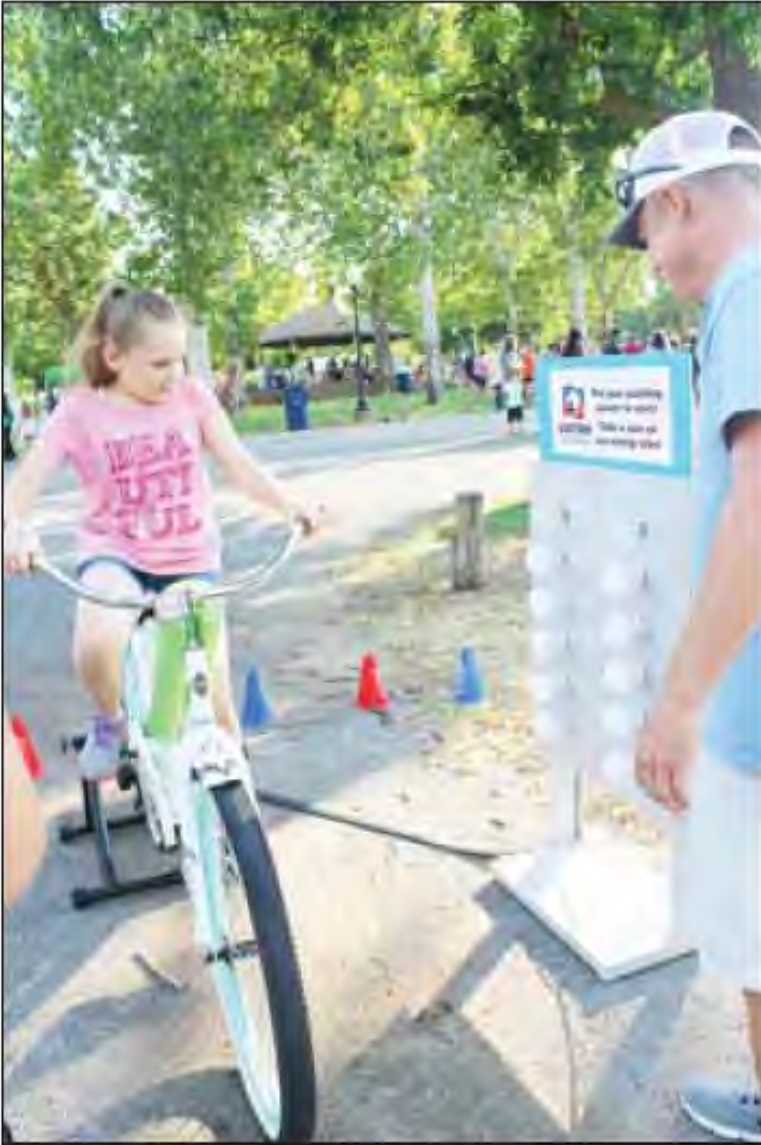
This little girl took a spin on the Energy Bike during Fiesta at Fuqua, a back-to-school activity held annually in Duncan. Pump the pedals hard enough and all the incandescent and LED bulbs will light up.