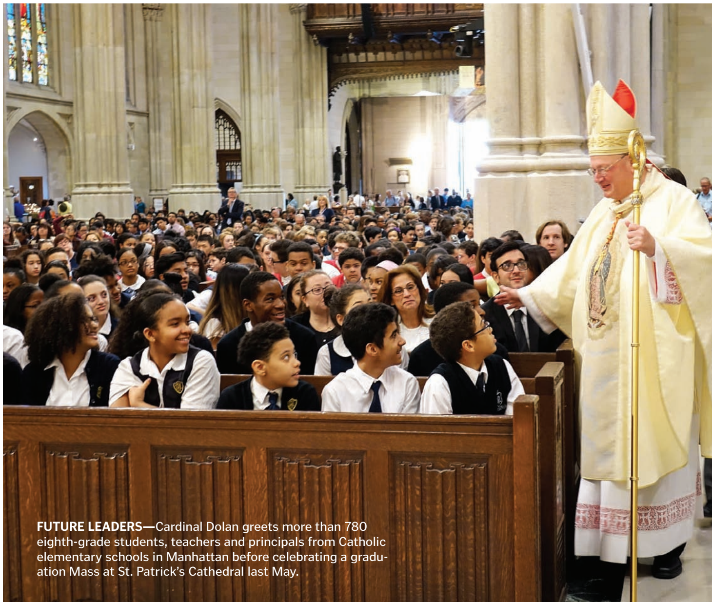
FUTURE LEADERS —Cardinal Dolan greets more than 780 eighth-grade students, teachers and principals from Catholic elementary schools in Manhattan before celebrating a graduation Mass at St. Patrick’s Cathedral last May.