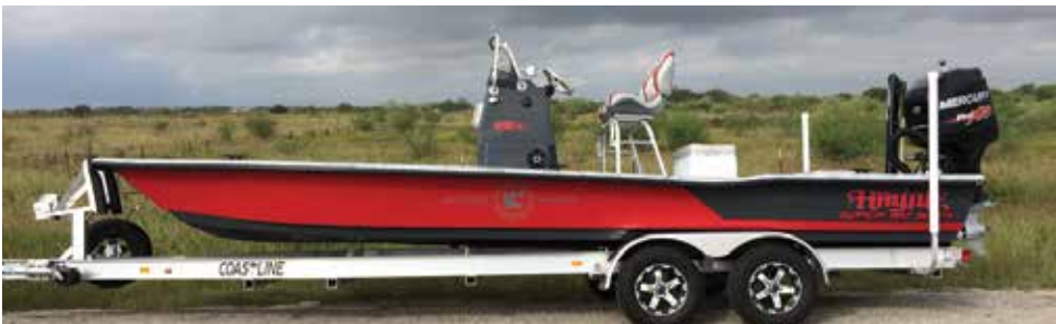
MidCoast's 23' Haynie Cat boat for the 2016 banquet.

The banquet was another success, with ev-