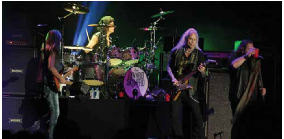
Lynyrd Skynyrd finished the CCA 2015 Concert For Conservation evening to a standing, singing along and applauding CCA crowd.