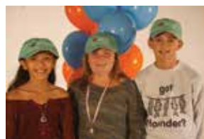
For the first time ever in the history of the STAR Tournament, the StarKid $50,000 Scholarship Division was dominated by little lady anglers, ages 8, 9 and 10 years old... WOW! Now that's what we call girls with "reel" power!