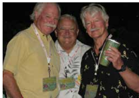
A few of the Corpus Christi CCA attendees at the Concert for Conservation.