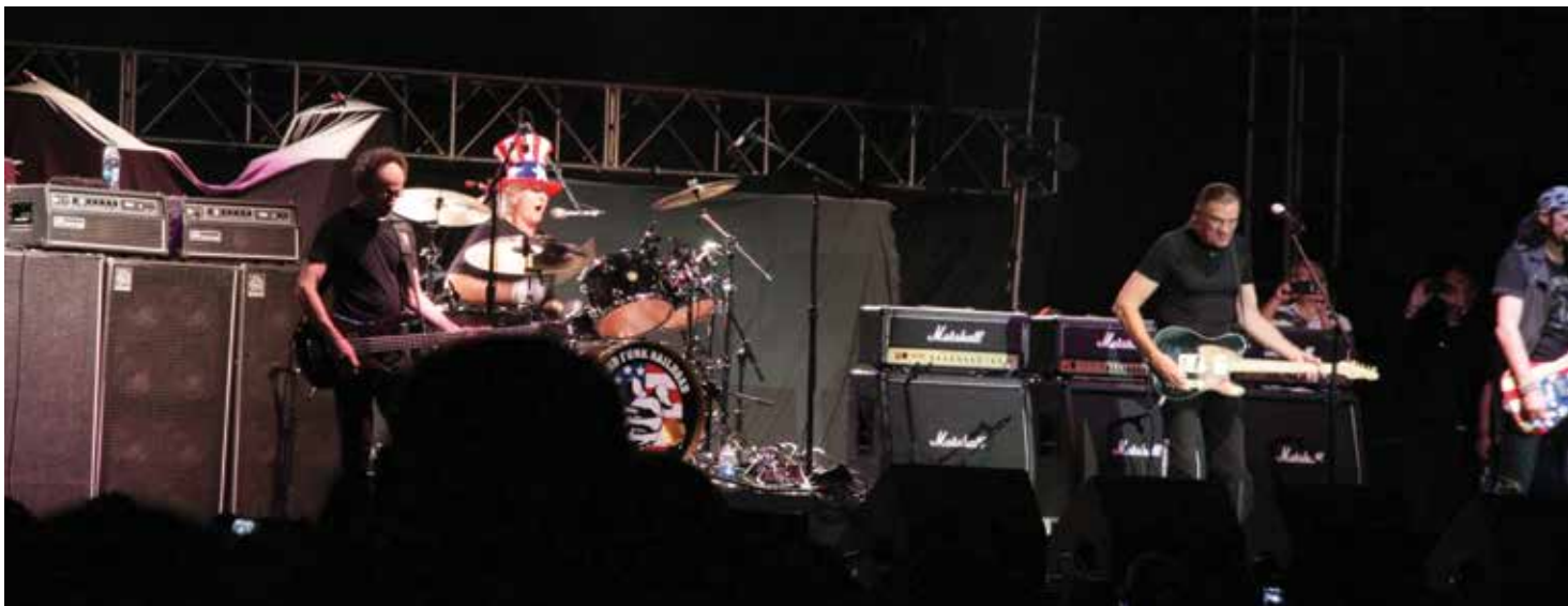
Grand Funk Railroad turned it up a notch early in the CCA Concert for Conservation. Get a load of that top hat.