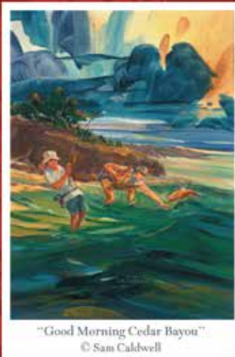
"Good Morning Cedar Bayou" © Sam Caldwell

CCA Membership and STAR registration included with your purchase.