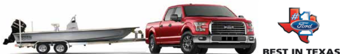
2015 Ford F-150 "Texas Edition" XLT SuperCab with Haynie 23 Bigfoot, the Redfish Division prize.