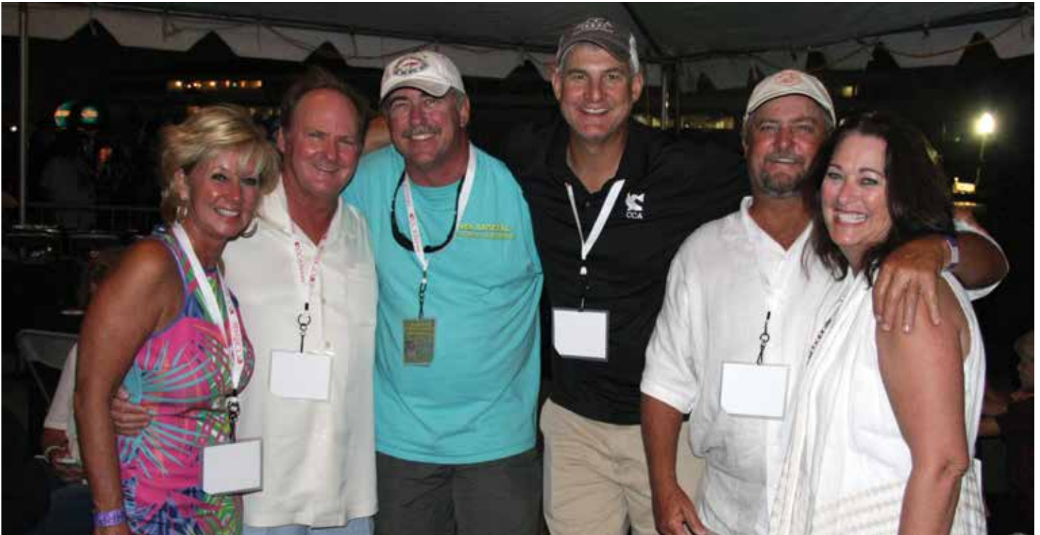
Six of the thousands of attendees having a great time at the 2015 Concert For Conservation.