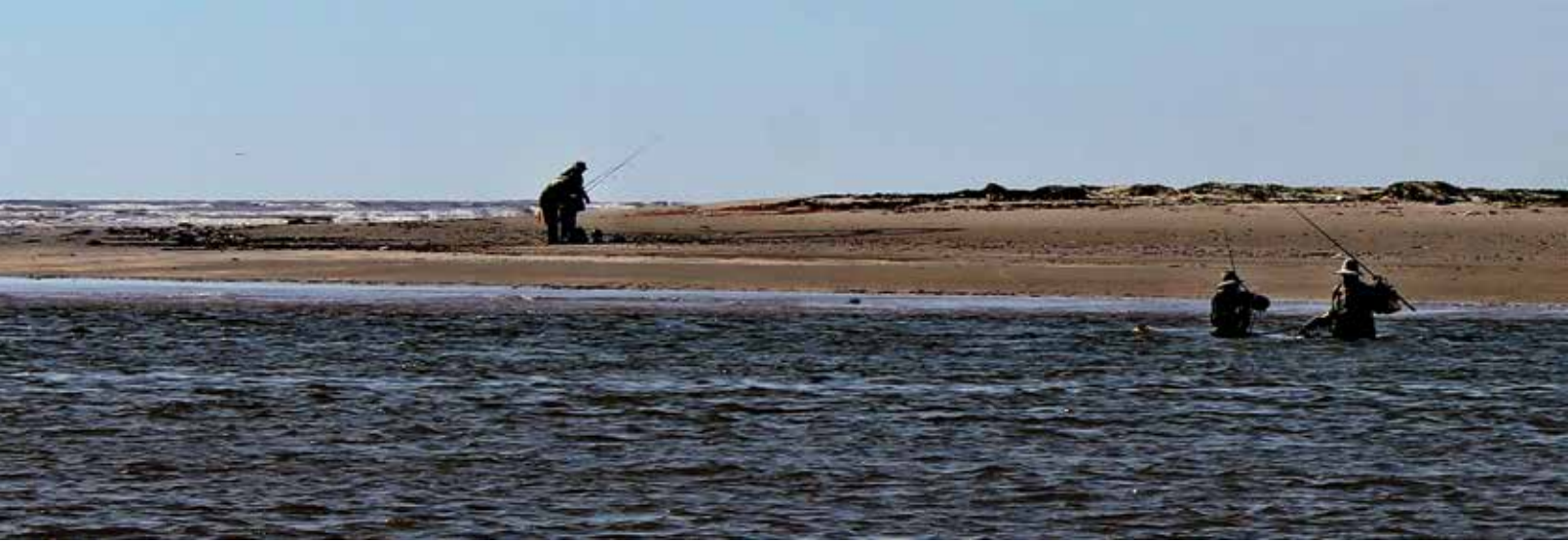
October 6, 2015, aerials from a year after the opening. Above, wade fishermen work near the mouth of the pass. At lower right, a shoreline shows the constant influence of heavy winds and tides.

Then you have those days where you experience a trip like never before and you simply seem to throw your bait in a fish's mouth every cast.