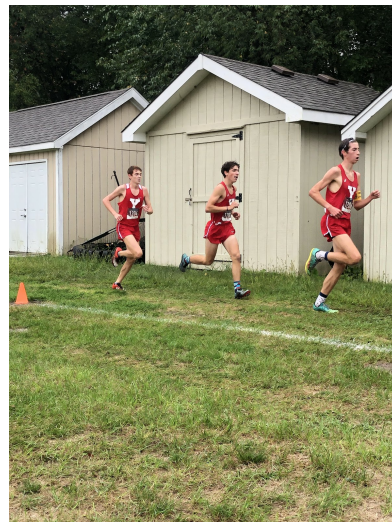
Varsity Boys Competing against Minooka at YHS on 9/12/20