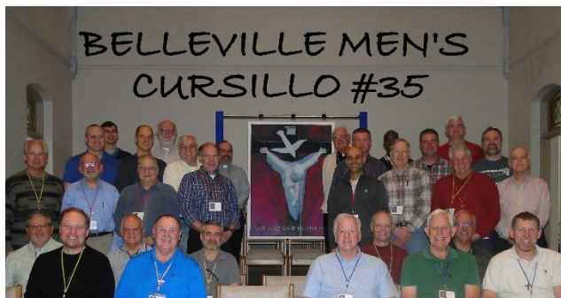
WE ARE ONE IN CHRIST