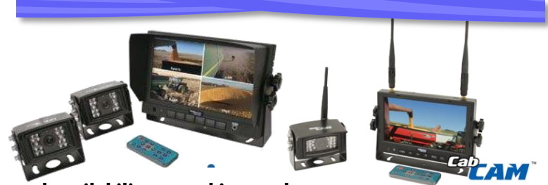
10% OFF on Cameras