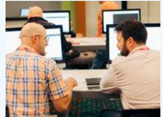
Managing Protection with Zerto