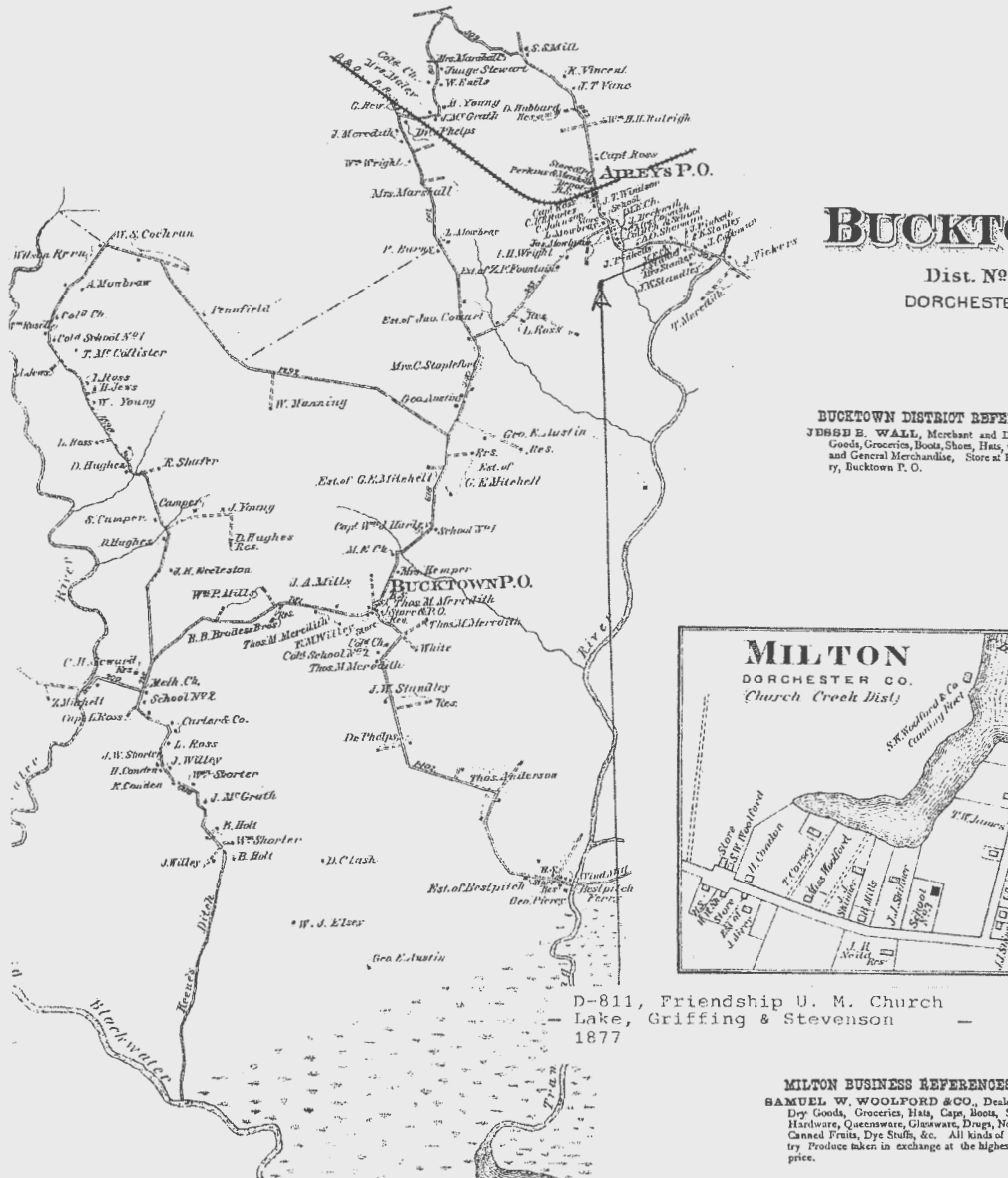
D-811, Friendship U. M. Church Lake, Griffing & Stevenson 1877