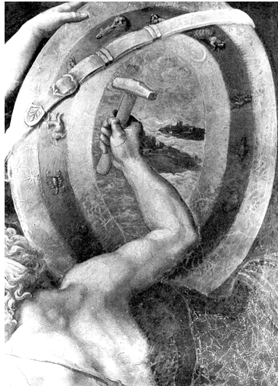
Romano’s painting of Achilles’s shield from the Sala di Troia in the ducal palace in Mantua.