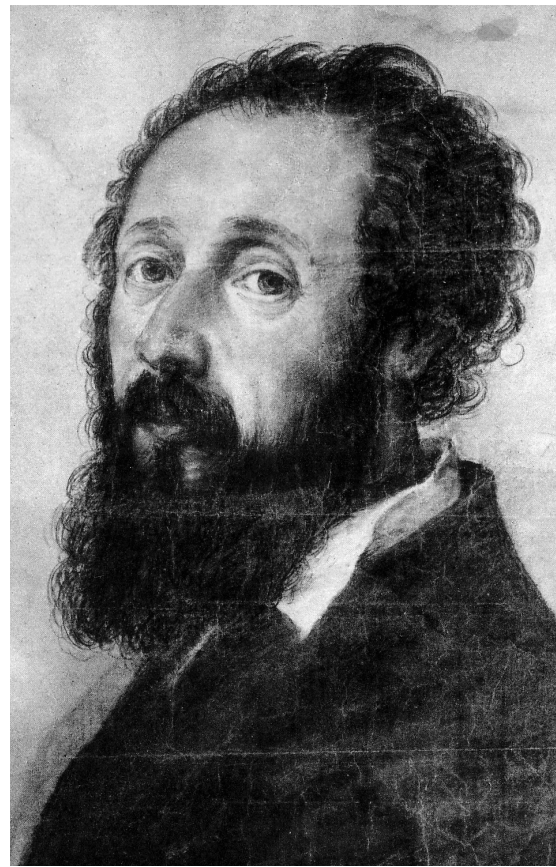
Giulio Romano, probable study for lost self-portrait; Florence, Uffizi, cat. # 367.