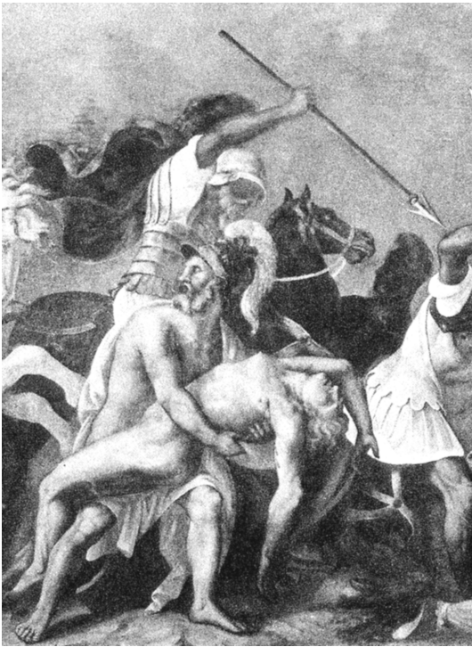
Closeup of the central figure of Achilles from Romano's "The Death of Patroclus" (see cover illustration) as he avenges his friend. Spear in hand, his figure is half-hidden by the figure of Menelaus while his face is hidden by his raised arm.

above the corpse, appears a figure Shakespeare seems to be describing in Lucrece —