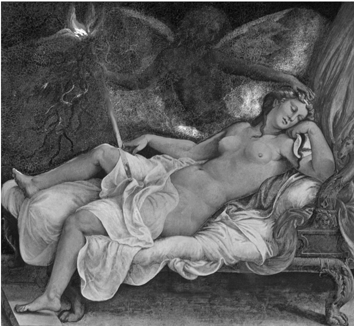
Il Sogno di Ecuba, (The Dream of Hecuba) by Giulio Romano, in which the youthful Hecuba, wife of Priam and mother of Hector, is threatened by a demon in a sexual nightmare.