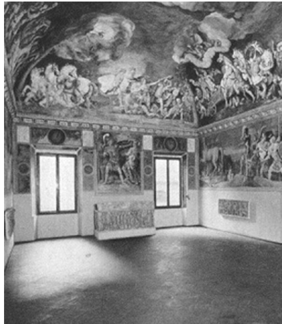
Romano's Sala di Troia at the ducal palace of the Gonzagas in Mantua.