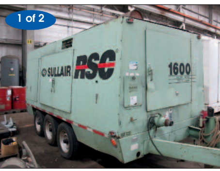
SULLAIR RSC TRAILER MOUNT AIR COMPRESSOR MODEL 1600H-D10-CAT