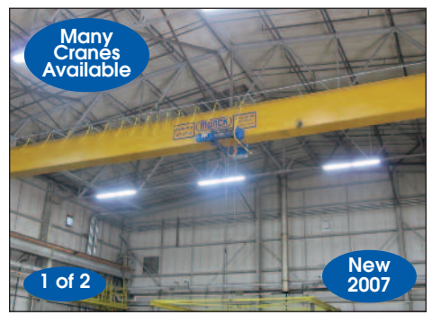
MUNCK 10 TON BRIDGECRANE