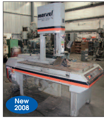
Marvel Vertical Band Saw Model 8-Mark-II