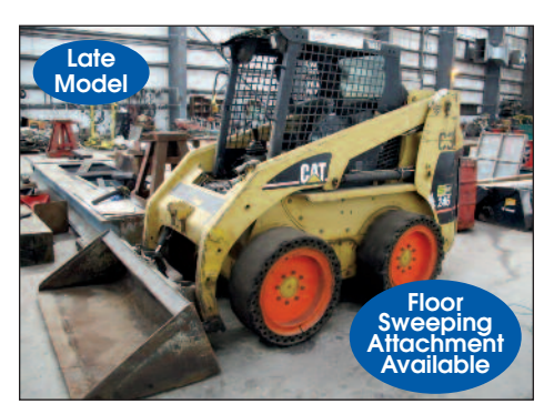
CATERPILLER # 246 "BOBCAT TYPE" STEER LOADER