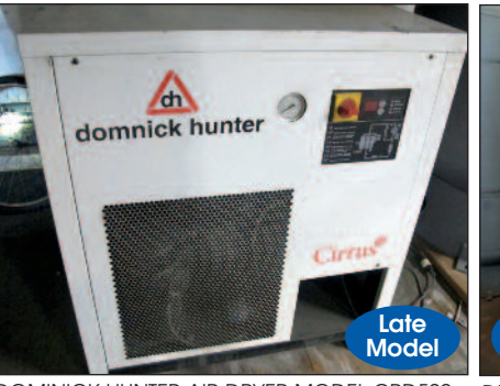
DOMINICK HUNTER AIR DRYER MODEL CRD500