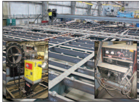
LARGE CAPACITY BRIDGE TYPE WELDING SYSTEM