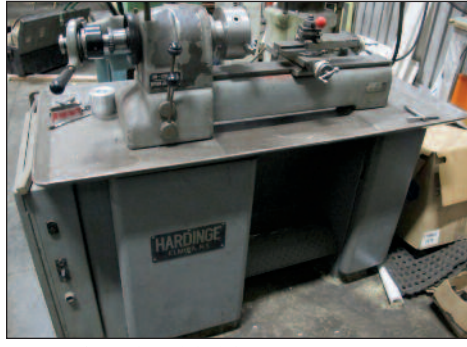
HARDINGE #DSM-59 SECONDARY LATHE

(New 1997) Super-Mill Universal Miller # FU-CME, Huron Universal Head, Power Over-arm, 11 3/4" x 51" Table, 50 Taper, DRO, 30-1400 RPM, S/N FU-2-CM2970