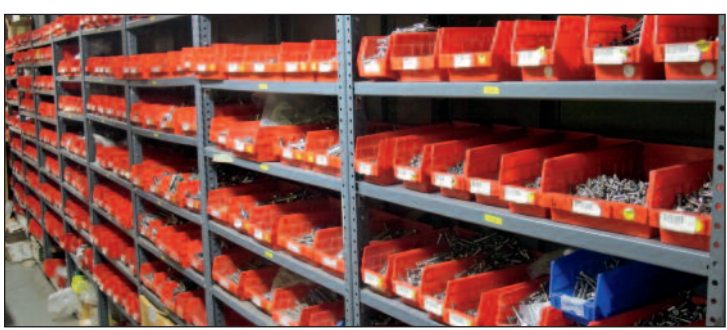
LARGE ASSORTMENT OF HARDWARE, FITTINGS, VALVES, FASTENERS, ETC.