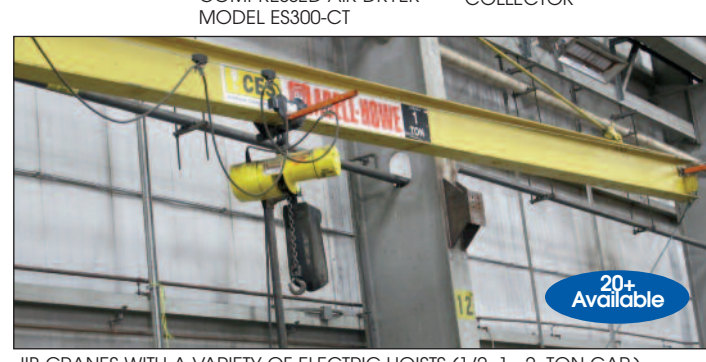
JIB CRANES WITH A VARIETY OF ELECTRIC HOISTS (1/2, 1, 2, TON CAP.)