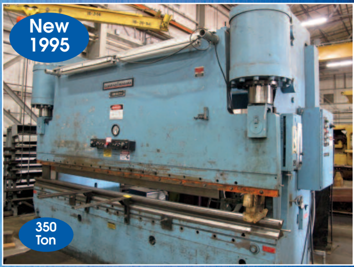
CLEARING/NIAGARA HYDRAULIC PRESS BRAKE