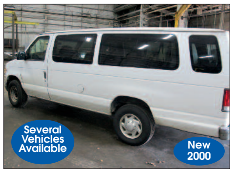
FORD # E-350 "SUPER DUTY" 10 PASSENGER VAN