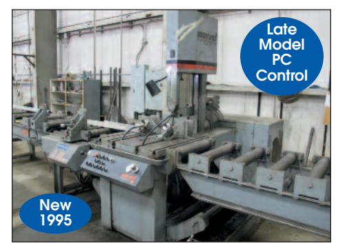
MARVEL/ARMSTRONG BLUM VERTICAL BAND SAW MODEL SERIES 81-A11-PCII