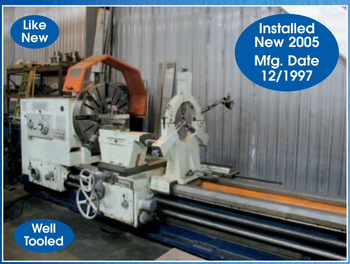
LANSING H.D. ENGINE LATHE 56" X 336" CAPACITY

Dereckion Snipyord 837 Seaview Avenue • Bridgeport, Connecticut 06607