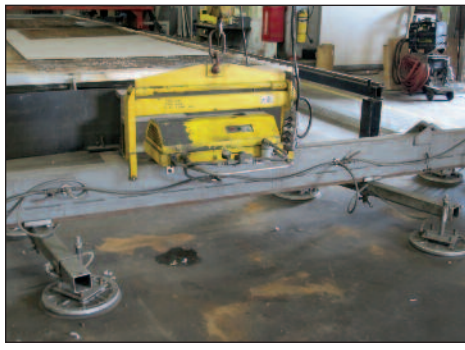
PNEUMATIC SHEET-PLATE LIFTER