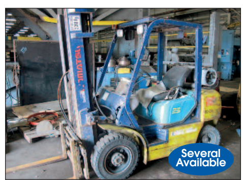
KOMATSU #FG-15 FORKLIFT 3000 LB. CAP.