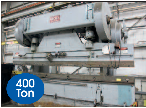
CHICAGO DRIES & KRUMP MECHANICAL PRESS BRAKE MODEL 400-D-10