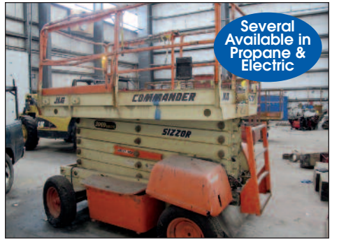
JLG ELECTRIC & GAS SCISSOR LIFTS