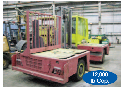
BAUMANN SIDE LOAD FORKLIFT MODEL GX60-14-40