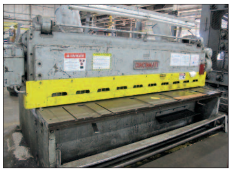
CINCINNATI # 2510 POWER SHEAR 10' X 3/8" CAPACITY