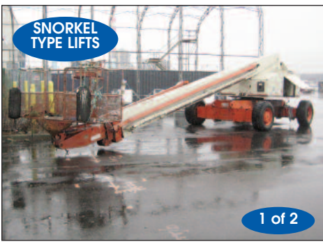
JLG "LONG REACH" PORTABLE MAN-LIFTS

Jet Vertical Woodworking Band Saw Model #JWBS-20-3 Dayton 18" Metal Cutting Band Saw Model #6Y942 Grizzly Model #G-1148 15" Vertical Band Saw Delta Vertical Band Saw Model #28-243S