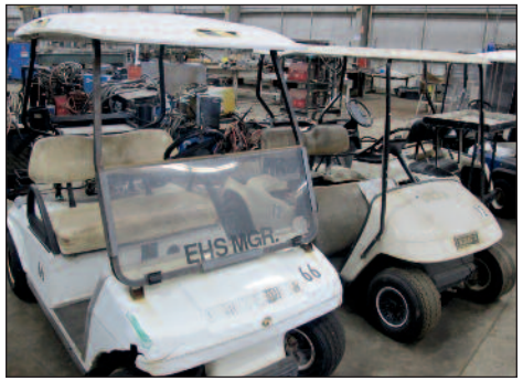
VIEW OF GOLF CARTS

(New 1998) Dodge SLT 10 Passenger Van, Vin #2B5WB35Z1WK113405