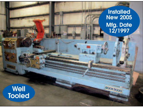
LANSING "GAP TYPE" ENGINE LATHE 31.5" X 118" CAPACITY

Hardinge Second Operation Lathe # DSM-59, S/N N/A