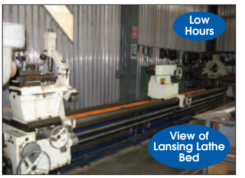
LANSING H.D. ENGINE LATHE 56" X 336" CAPACITY

IMPORTANT NOTICE: DUE TO STRICT GOVERNMENT GUIDELINES & TIME RESTRICTIONS ALL RIGGING & REMOVAL (OTHER THAN HAND CARRY ITEMS) MUST BE PERFORMED BY PEDOWITZ RIGGING CO. PLEASE CONTACT ANDY CONTI (203) 410-8948 FOR PRICING & SCHEDULING.