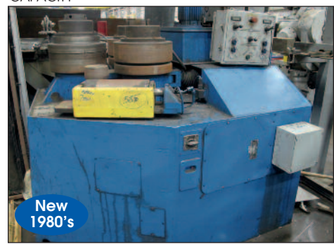
PULLMAX # Z-41 ANGLE BENDING ROLL