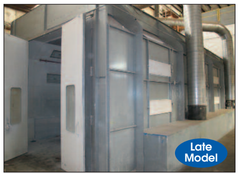
LARGE CAPACITY VENTED PAINT BOOTH