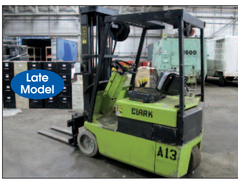
CLARK 3-WHEEL ELECTRIC FORKLIFT #TM-17