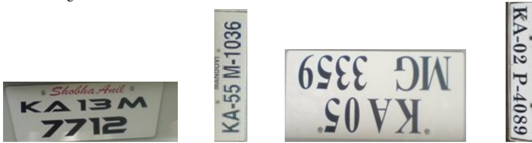
Figure. 1 (a) 0^{\circ} Orientation (b) 90^{\circ} Orientation (c) 180^{\circ} Orientation (d) 270^{\circ} Orientation

orientations. The samples of segmented number plate in different orientation directions are shown in Figure1.