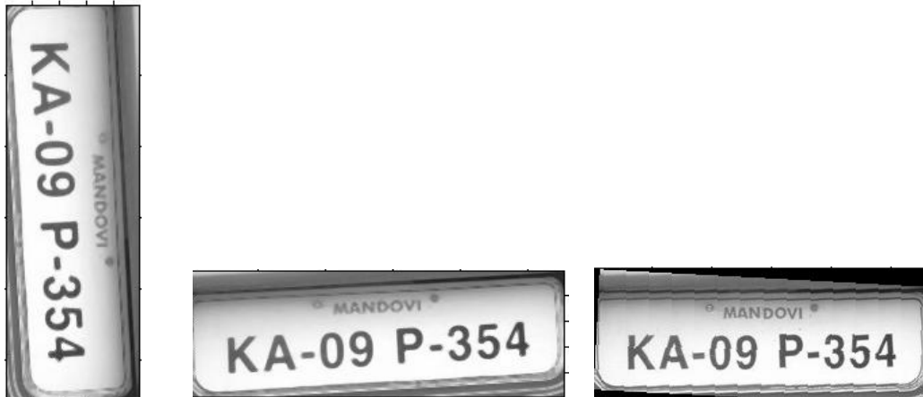
6 (a) 270° Orientation b) Corrected Number Plate with Skew c) Skew Corrected Number Plate

The results of skew detection shows 85.71% of correct skew estimation, 14.29% of failure cases and the results are tabulated in Table.3. Failure case in skew detection is noticed in segmented number plate due to failure in estimation of larger line and finding angle.