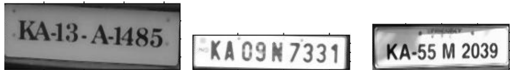
(e). Corrected image of (b) (f). Corrected image of (c) (g). Corrected image of (d)

The results of the experiments are tabulated in table2. The result of overall efficiency of proposed method is 65.05% with 22.42% of wrong detections and 12.53% of rejections. The rejections are due to failures in autocorrelation threshold values. The wrong detections are due to overlapping of autocorrelation threshold values.