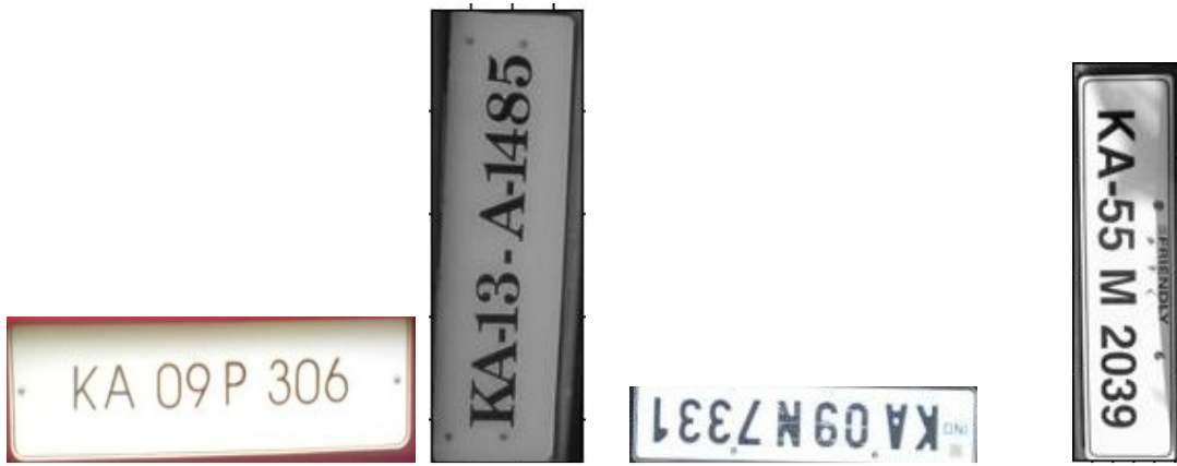
Figure 5. (a) 0^{\circ} Orientation (b). 90^{\circ} Orientation (c). 180^{\circ} Orientation (d). 270^{\circ} Orientation