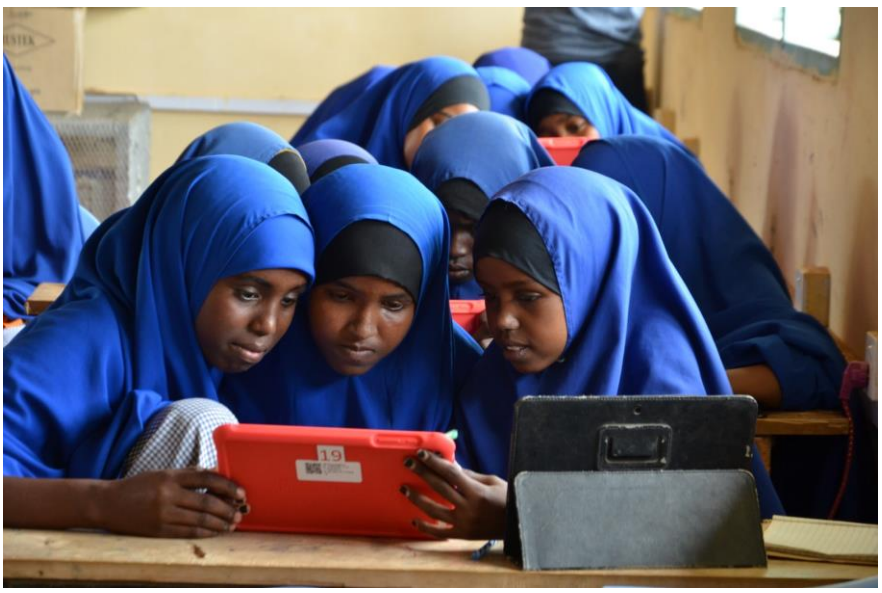
Girl students using tablets pre-loaded with educational software at their Instant Network Schools (INS) classroom in Juba primary school, Dadaab.