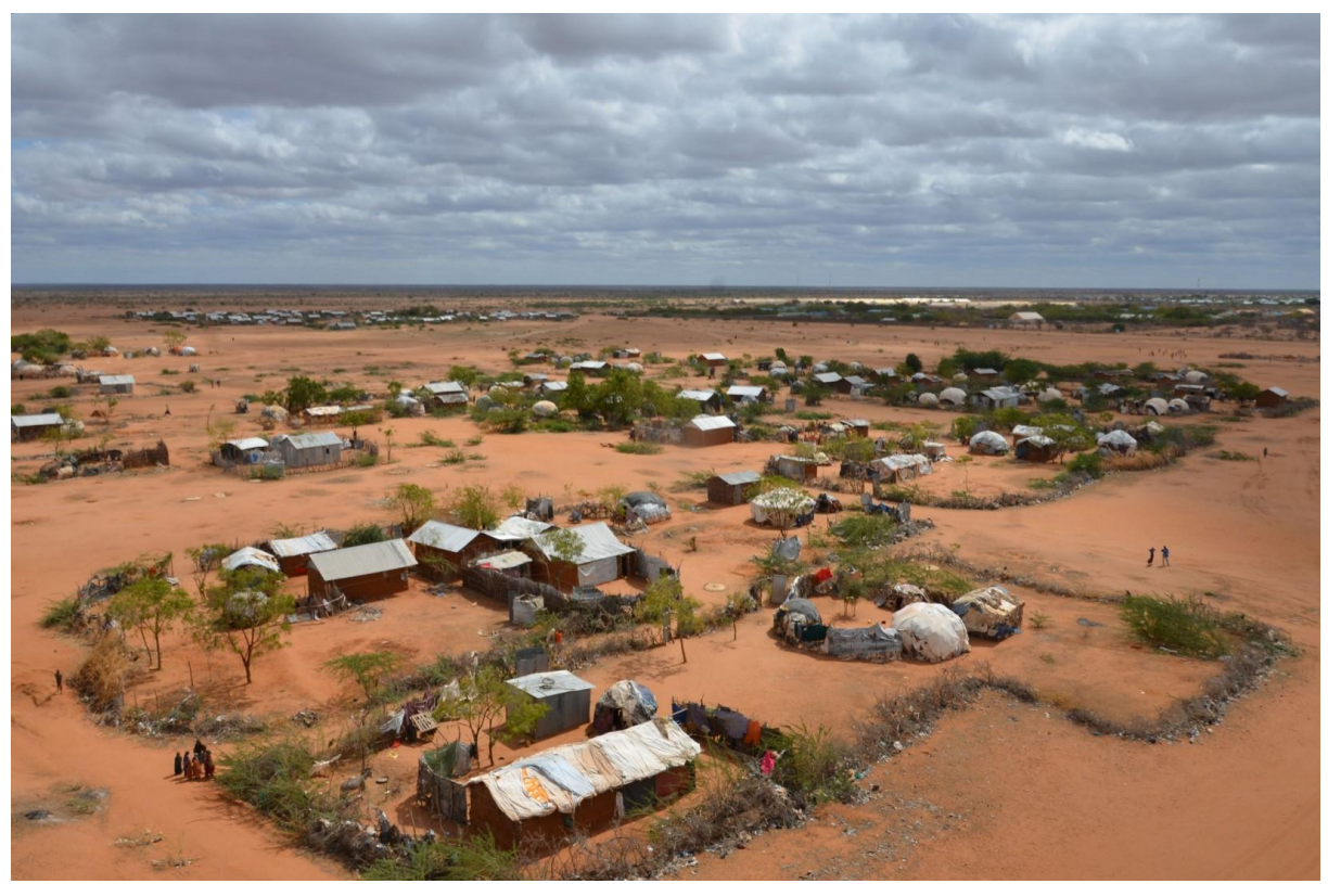
Ifo 2 camp of Dadaab with current population of 22,766 individuals of whom 7,893 individuals have registered for Voluntary repatriation.