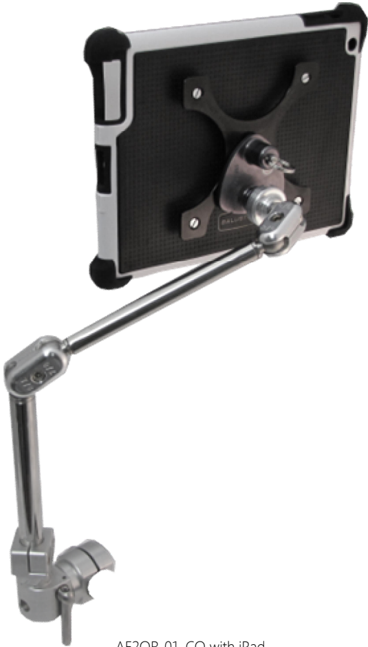
AF2QR-01-CQ with iPad Standard Holder (SBIPD)

A new mounting system line from Daedalus Technologies Inc, the DAESSY Lite Mounts build on years of experience and quality. Designed for switch mounting, lightweight devices under 5lbs/2.3Kg or tablets the component based system has numerous possibilities. Fixed tablet holders or Quick Release System. Choose a kit or build your own, the DAESSY Lite Mount will support your lightweight mount needs.