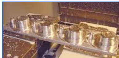
Total Quick Release Base - TUSB