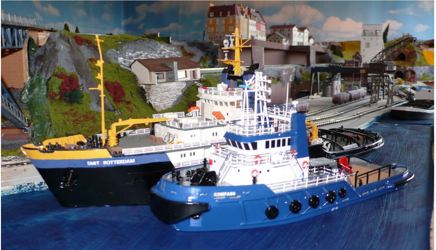
Scale models of the tugs SMIT ROTTERDAM and COMPASS moored alongside in a display