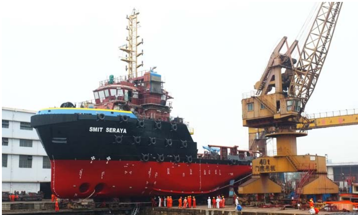
The 7300 hp ( 95 ton BP) SMIT SERAYA under construction at the Lingsian Yard in Wuzhou China

Your feedback is important to me so please drop me an email if you have any photos or articles that may be of interest to the maritime interested people at sea and ashore