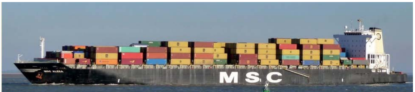
The MSC ALEXIA at the Westerscheldt River

Om uit te schrijven klik hier (Nederlands) of bezoek de inschrijvingspagina op onze website. http://www.maasmondmaritime.com/uitschrijven.aspx?lan=nl-NL