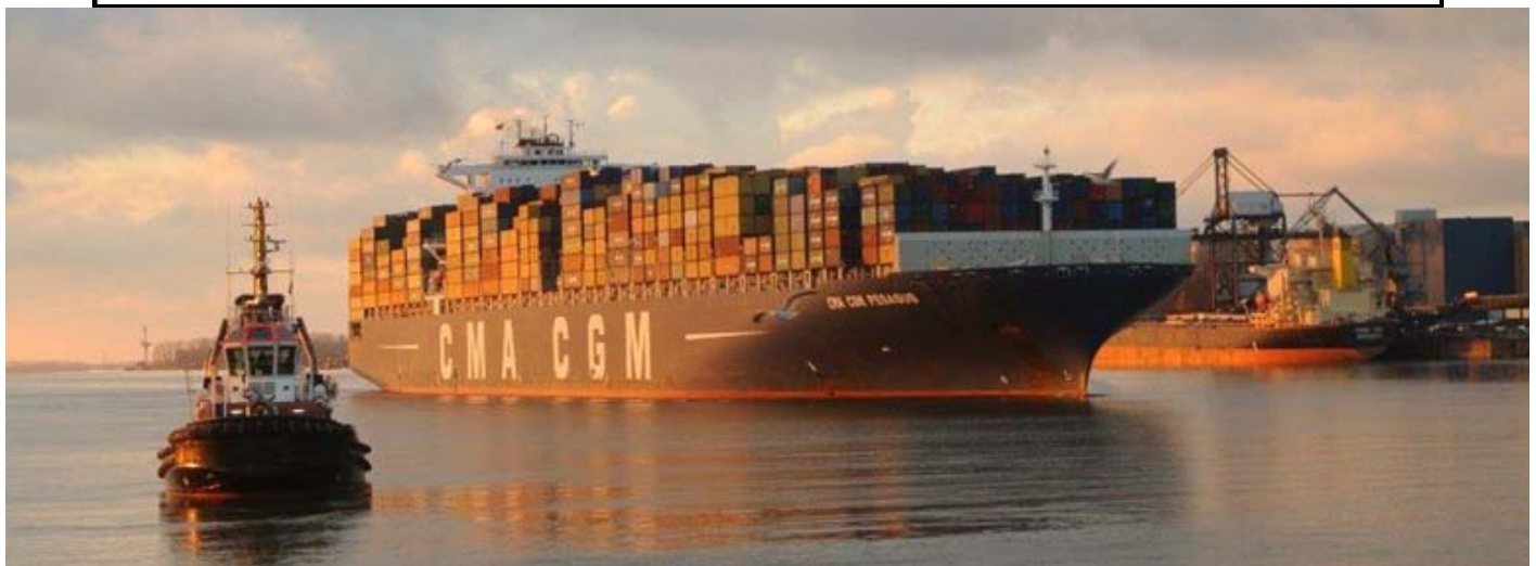
The tug BUGSIER 10 ready to assist the CMA CGM PEGASUS on arrival to Hamburg. Alongside on the background the bulkcarrier PREMA ONE