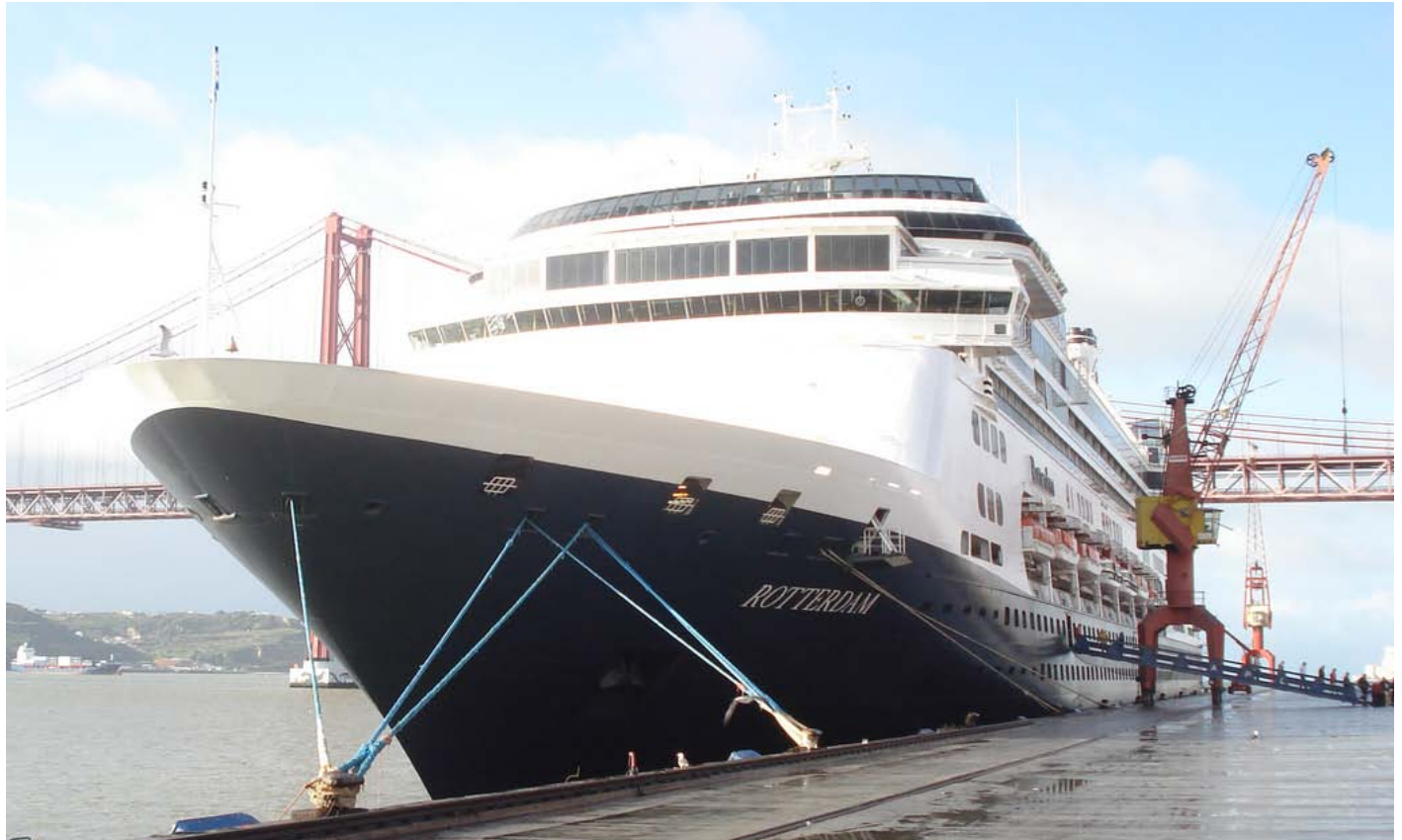
HAL's ROTTERDAM moored in Lisbon