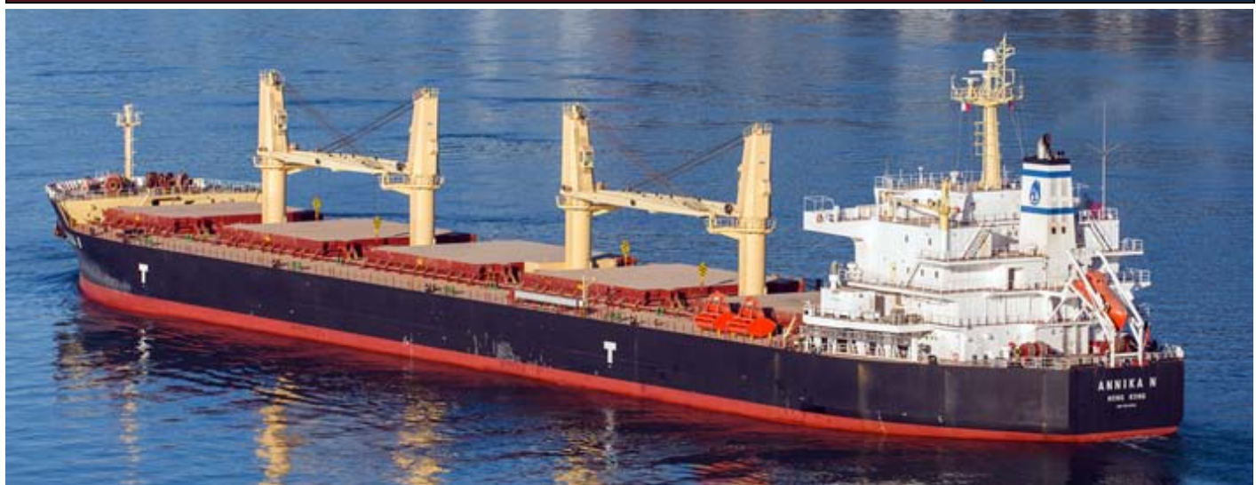
12-01-2013 the ANNIKA N seen departing in Vancouver harbour