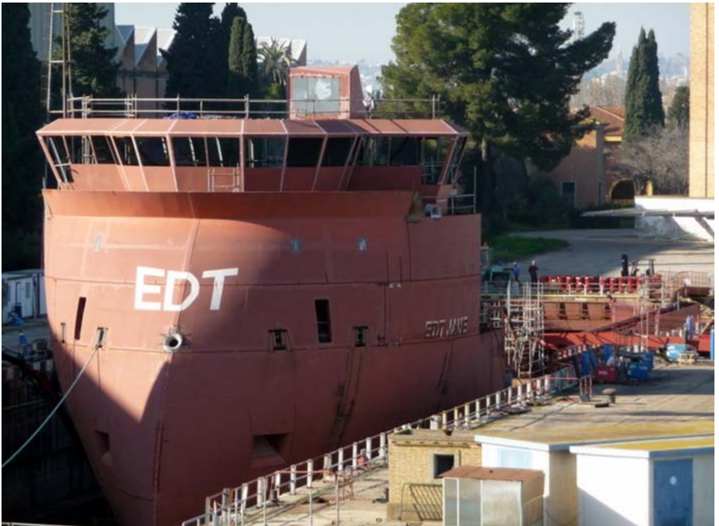
The hull of August 2009 launched EDT JANE spotted at Astilleros in Sevilla