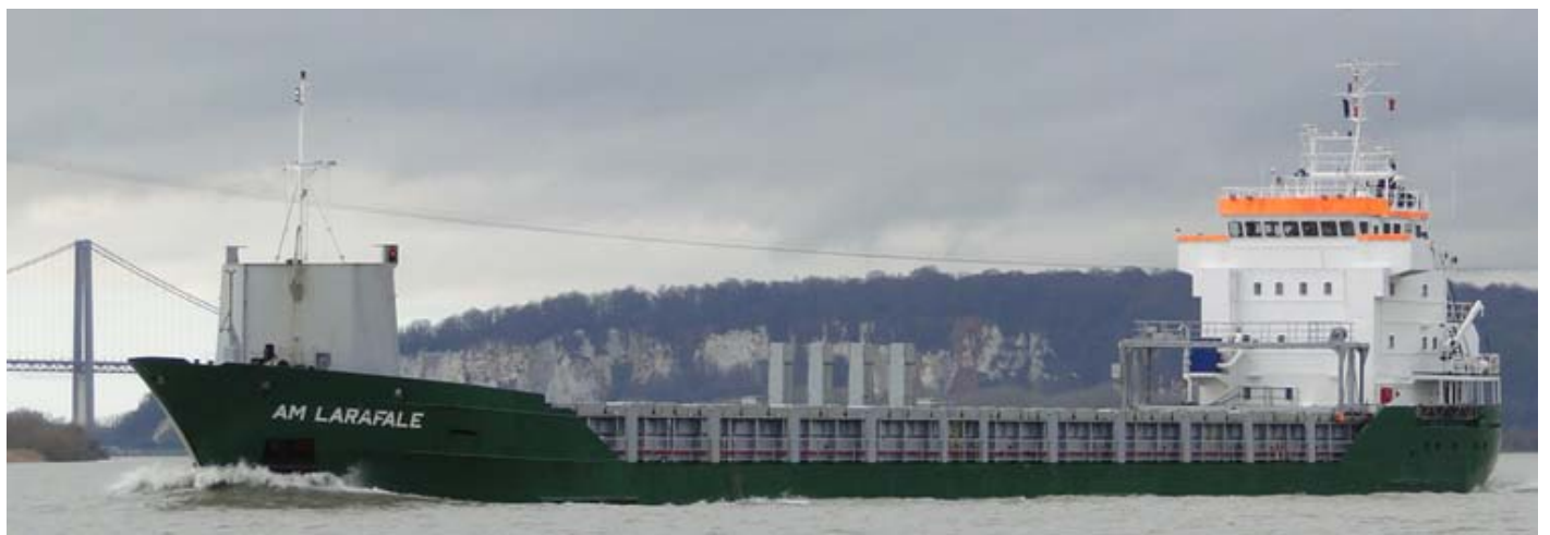
The AM LARAFLE at the River Seine