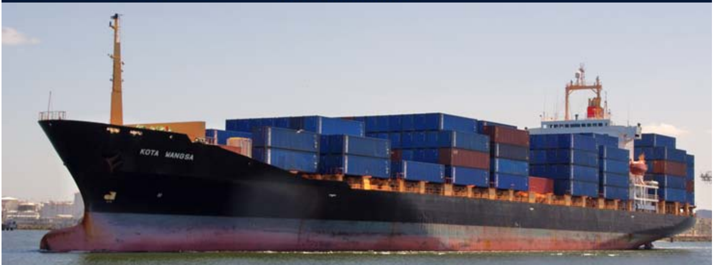
The KOTA WANGSA outbound from Melbourne in the River Yarra