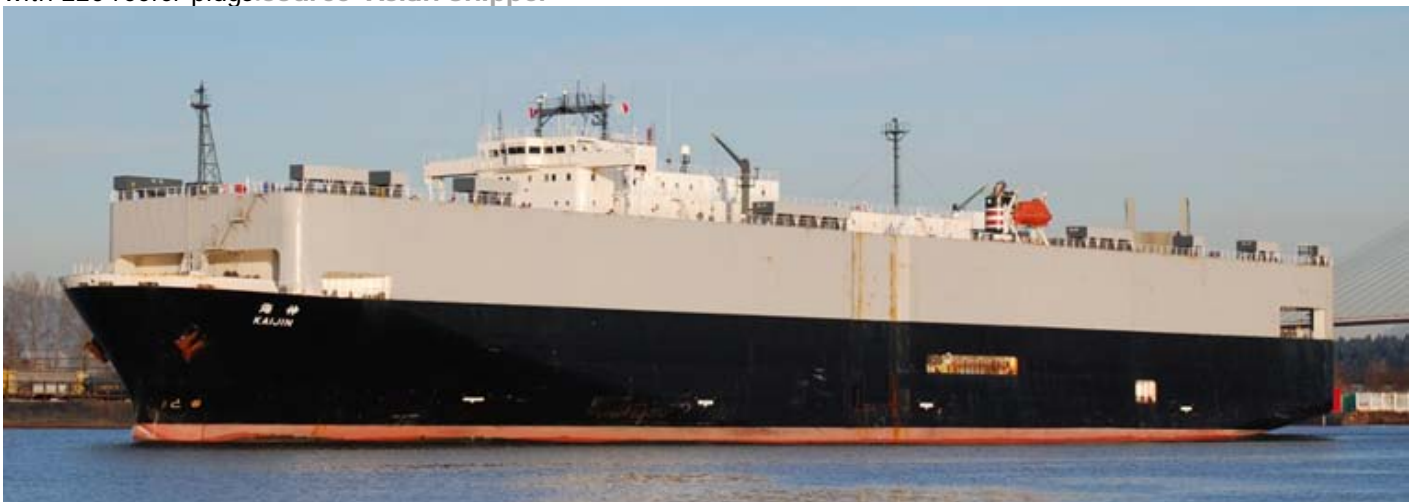
12-01-2013 NYK line car carrier KAIJIN downbound on the Fraser river

The Agadir-Port Vendres is a twice-weekly service, with the second call a week added, that uses two 900-TEU vessels with 220 reefer plugs. source Asian Shipper