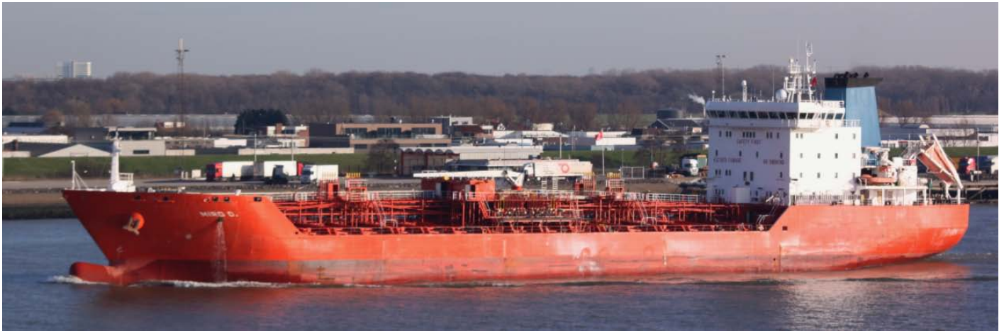
TheMIRO D outbound from Rotterdam