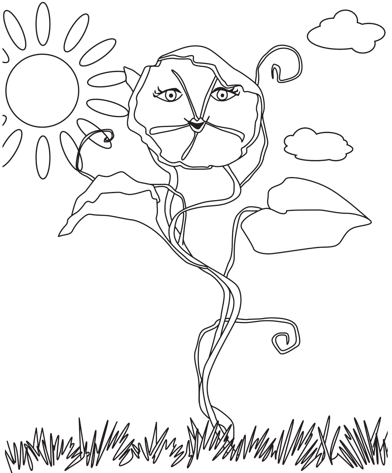
I'm Gloria the Morning Glory. I respect myself and others!