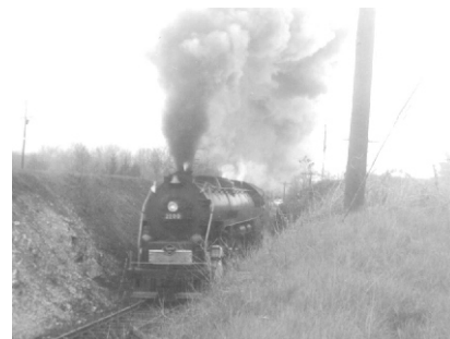
T-1 2100 near Gettysburg, PA. May 1961

Alas, the Iron Horse Rambles are a thing of the past. We were truly blessed back then to have a railroad that enjoyed running steam. Now, in the 21 st century, we know just how blessed we were, since "big steam" probably will never run again in the East. Thank goodness for the camera so the experience can be relived again and again.