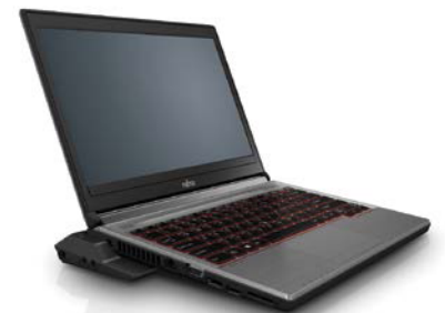
Shown with optional Port Replicator