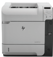
HP LaserJet Enterprise 600 Printer M601n

HP's business pacesetter tackles high-volume printing with legendary reliability. Count on this HP LaserJet to help conserve resources, customize printing policies, and improve security.