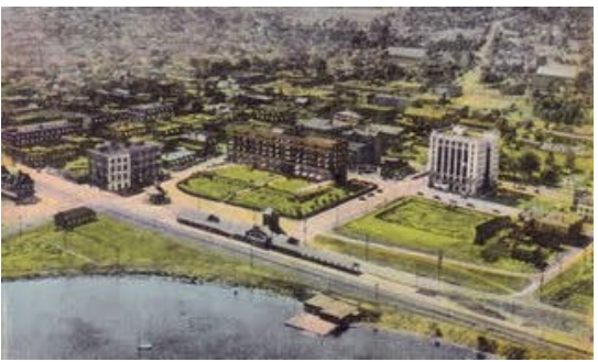
The left photo shows a calmer day at the CP station in about the same era. The photo on the right shows the same station (the very long