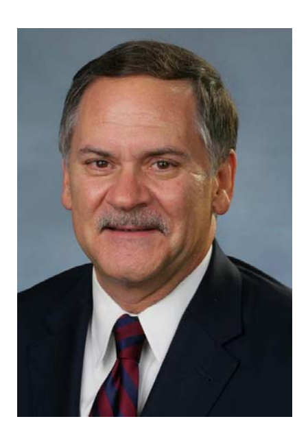
THANK YOU FOR YOUR 2016 LEADERSHIP!