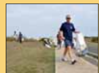
GTMO CPOA Cleans Streets pg 2