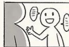
Over The Shoulder