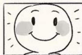
Extreme Close Shot