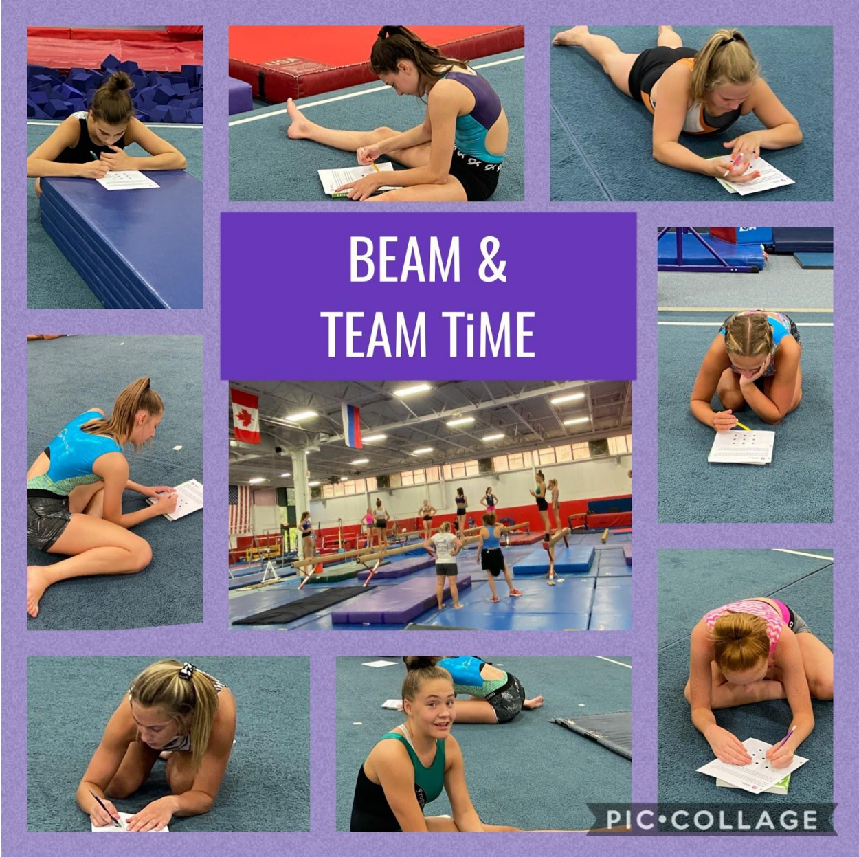
Our GYMNASTICS girls were getting after it this week!!