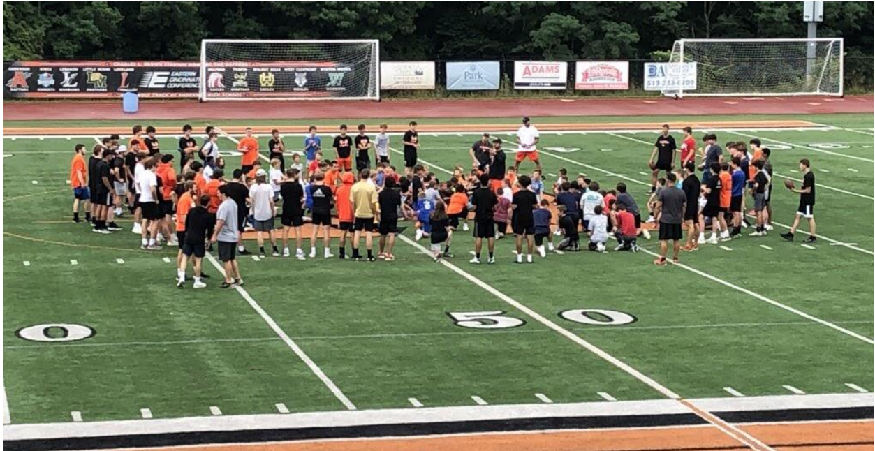
Youth Camps have been a blast! Great seeing suture Raptors coming out and working with our students!