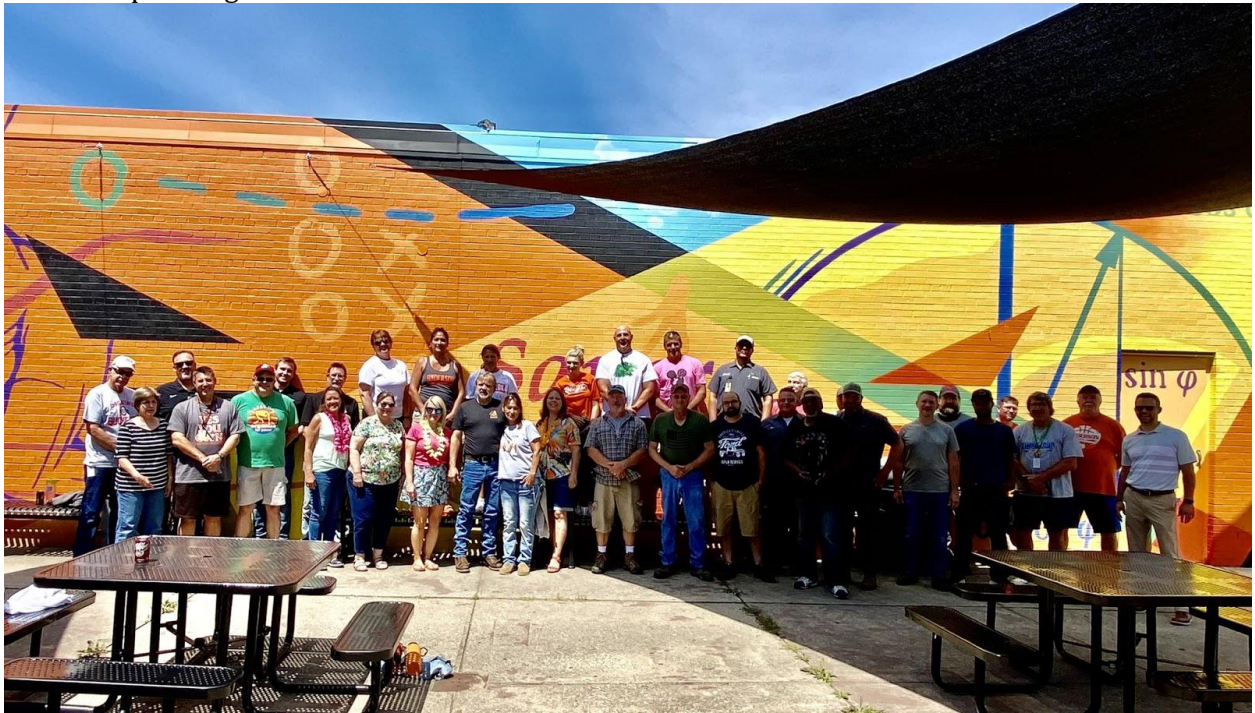
Summer cookout for the AHS office and custodial teams- delicious!