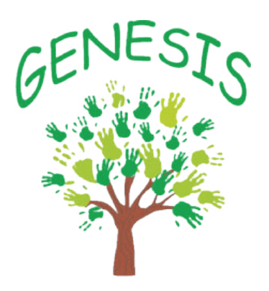
Early Childhood Program "In the beginning..." Genesis 1:1

Genesis Early Childhood Program is a ministry of Christ the Redeemer Catholic Church. Our purpose is to provide a safe, loving Catholic Christian environment where young children learn through participation in developmental and age-appropriate experiences.