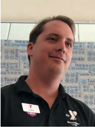
CHAD - YMCA staff