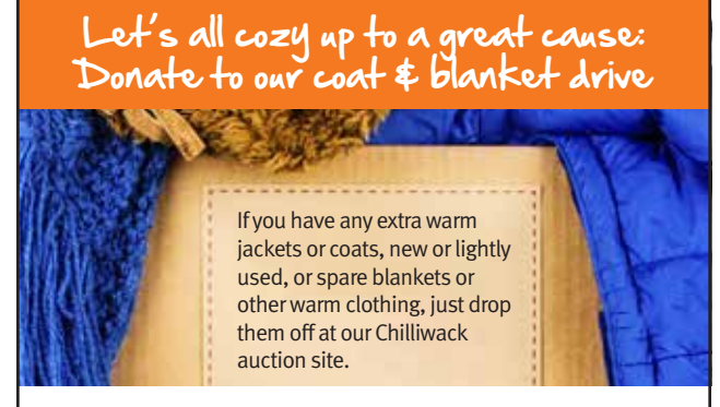
Drop off your items at: 42275 Industrial Way, Mon - Fri, 8am - 5pm