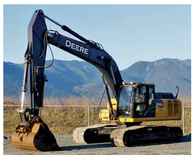
2015 John Deere 250G LC