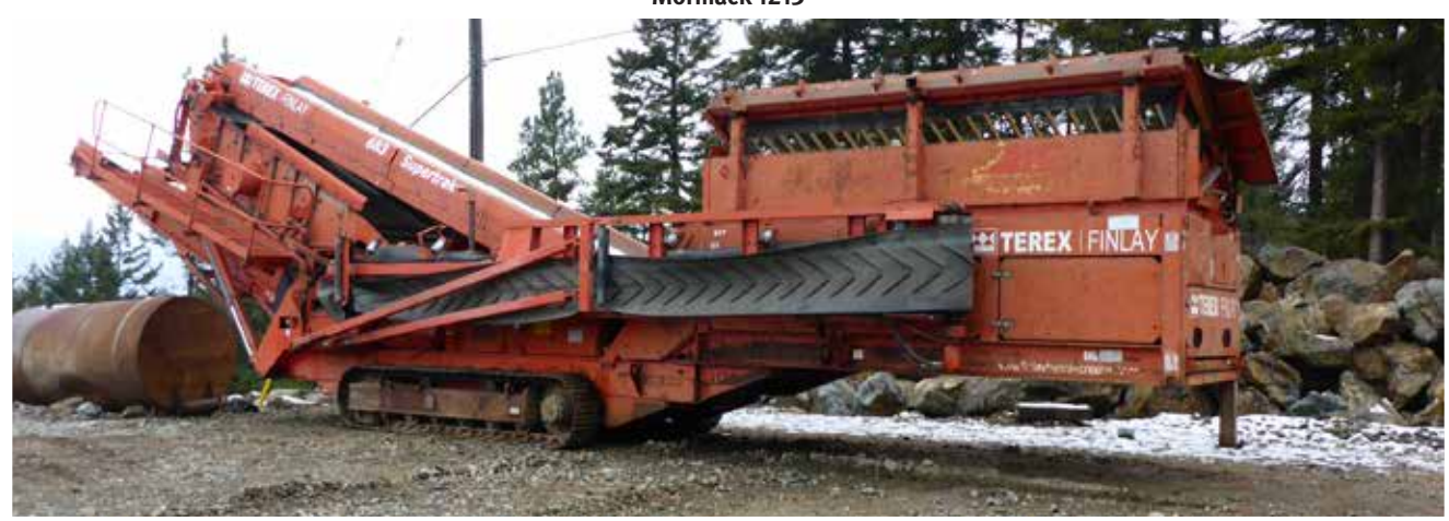
Terex Finlay 683 Supertrak