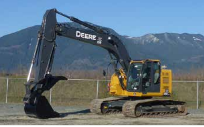
1 of 2 - 2017 John Deere 245G LC