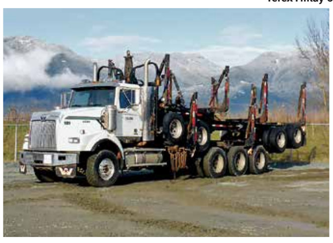
2015 Western Star 4900SA & 2017 Freflyt