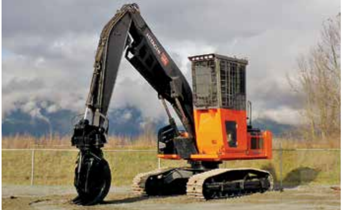
2013 Hitachi ZX240F-3 w/WBM