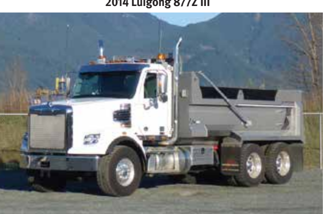
Unused - 2019 Freightliner 108SD 2019 Freightliner 122SD - Low kms

See complete auction and equipment information on our website