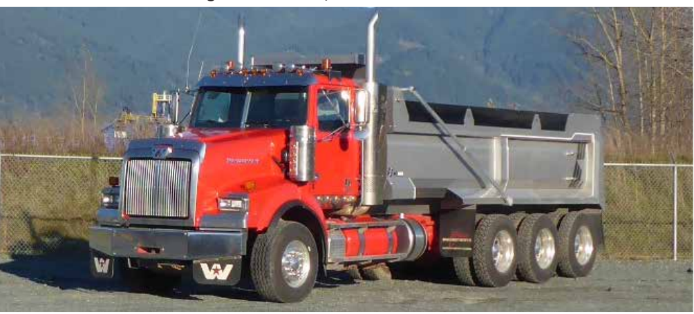
2016 Western Star 4900SA