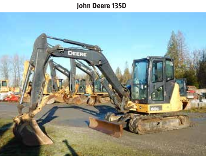
2017 John Deere 135G John Deere 135C 2015 John Deere 60G