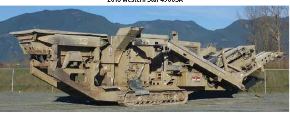
2015 KPI-JCI FT4240