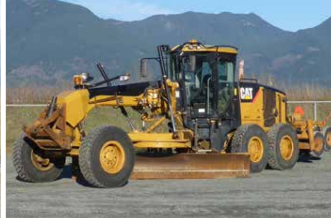
John Deere 700H LGP Caterpillar 160H 2011 Caterpillar 140M VHP Plus