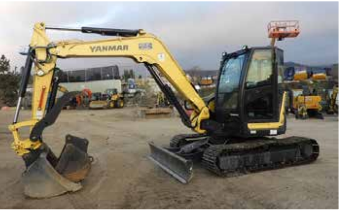
2018 Yanmar ViO80-A1