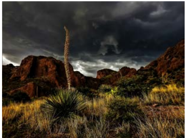
"The Calm before the Storm" by Gerald Guss (color, B)