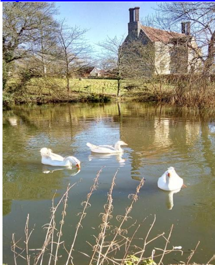
Penhurst Retreat Centre