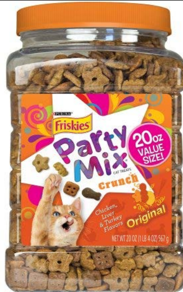
Friskies Party Mix Original Crunch Canister