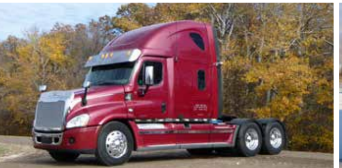
2009 Freightliner Cascadia CA125S