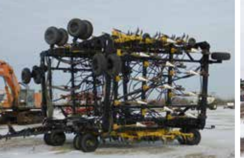
2007 Seedmaster 6612 66 Ft