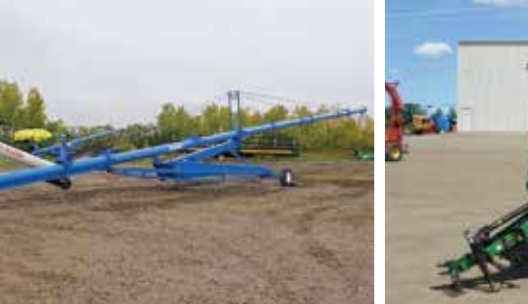
2017 Brandt 13110