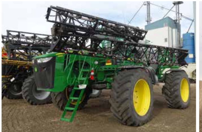
2014 John Deere 4940 120 Ft