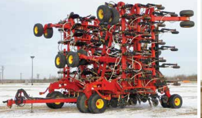
1 of 3 - 2013 Bourgault 3320PHD 76 Ft