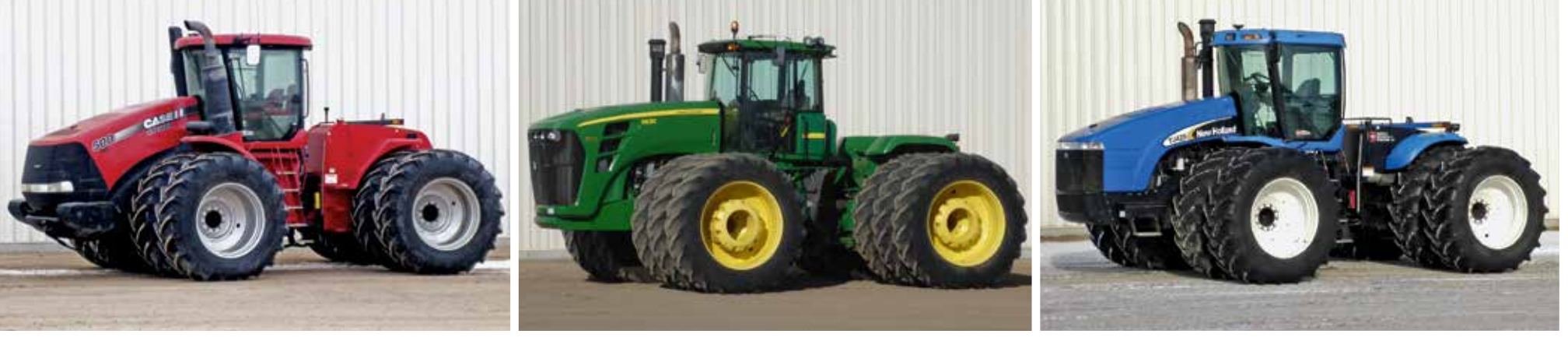
2012 Case IH Steiger 500