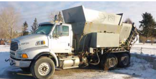
2008 Sterling LT9500 10 Cu Yd