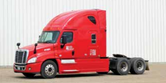
2014 Freightliner Cascadia CA125SLP

2014 Peterbilt 388 & 2016 BWS 55T 2+3 Combination Double Drop