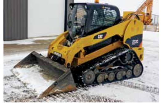
2012 Caterpillar 277C