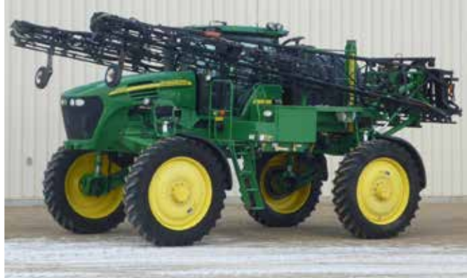
2007 John Deere 4720 90 Ft