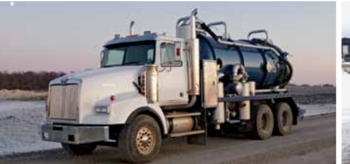
2002 Western Star 4964SX