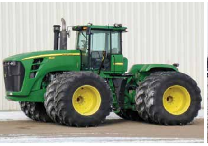
2007 John Deere 9530