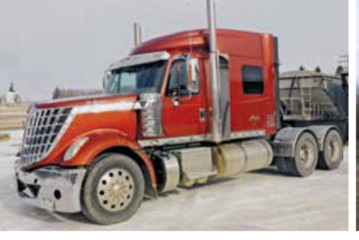
2015 International LoneStar