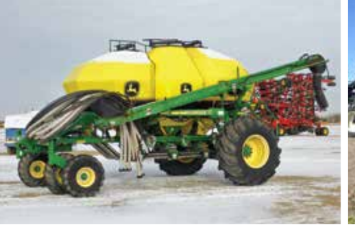
2007 John Deere 1910