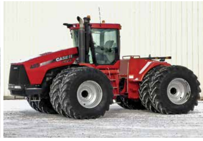
2011 Case IH Steiger 485