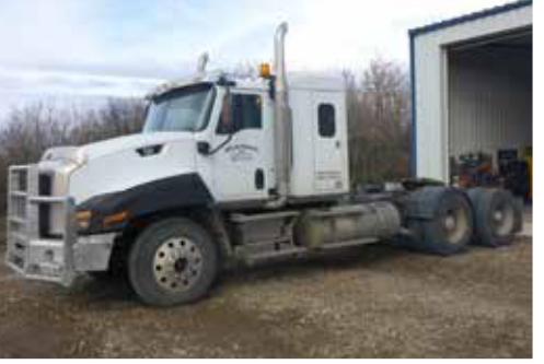
2014 Caterpillar CT660L