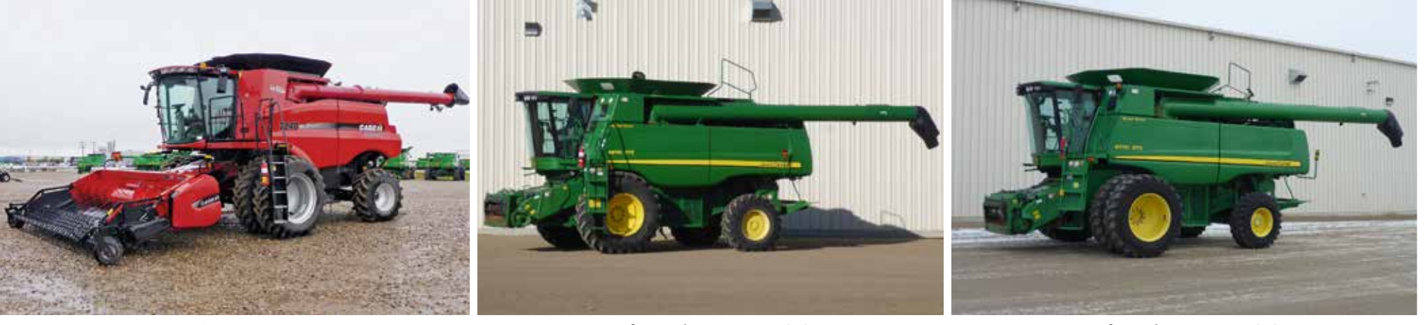
2016 Case IH 7240