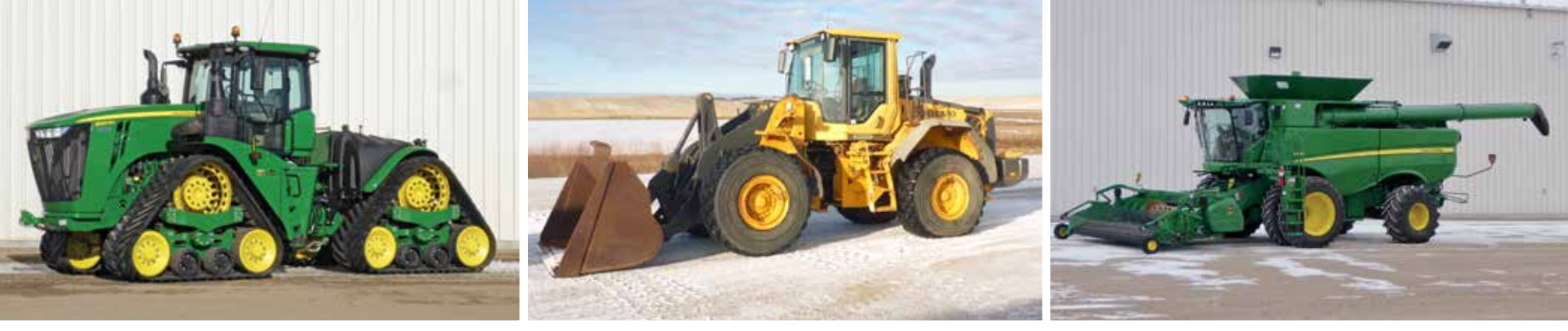
2017 John Deere 9520RX