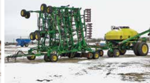
2011 John Deere 1830 61 Ft w/1910