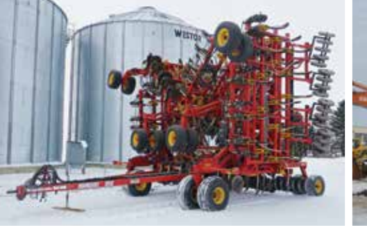
2012 Bourgault 5810 72 Ft