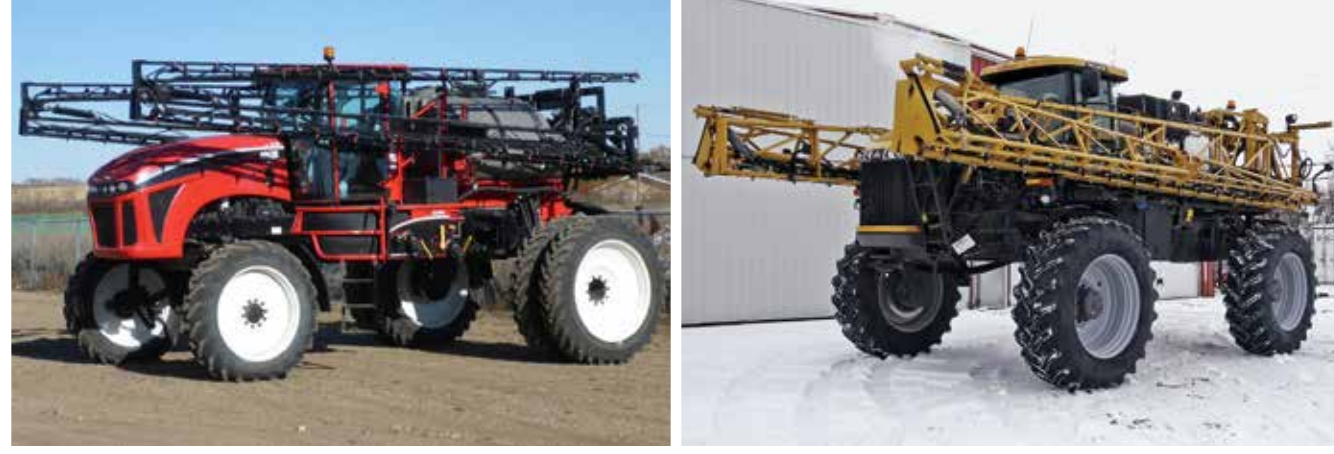
2016 Apache AS1020 100 Ft