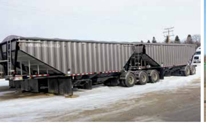
1 of 2 – 2016 Doepker Super B