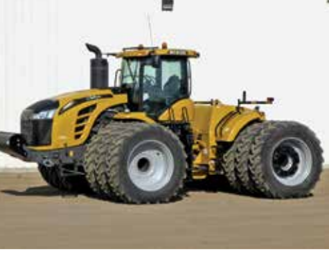
2019 Challenger MT975E

1 of 2 - 2016 New Holland SP.400F 135 Ft