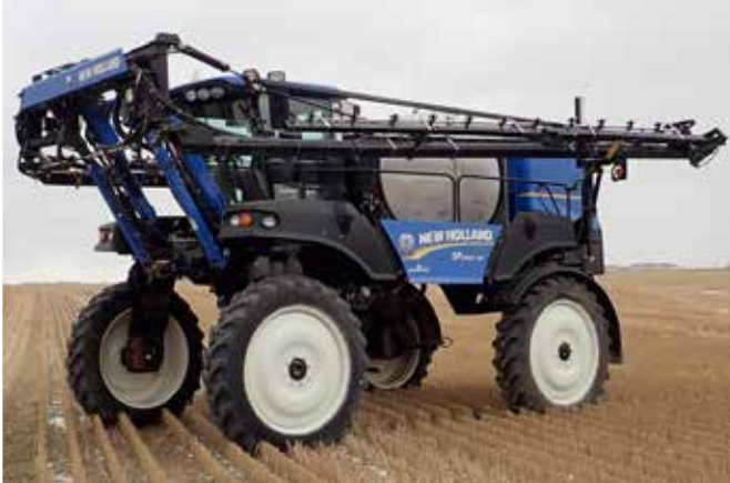
2011 New Holland SP.240F XP 100 Ft