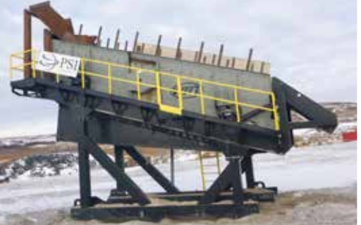
1 of 3 – WRT 72E624