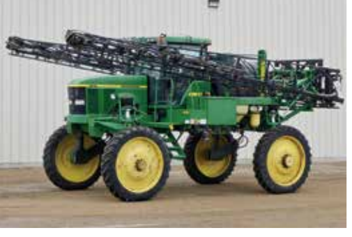
1999 John Deere 4700 90 Ft