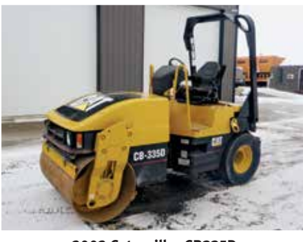
2002 Caterpillar CB335D