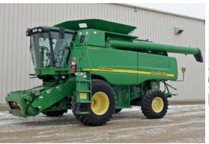
1 of 3 – John Deere 9760STS