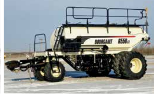
2012 Bourgault 6550ST