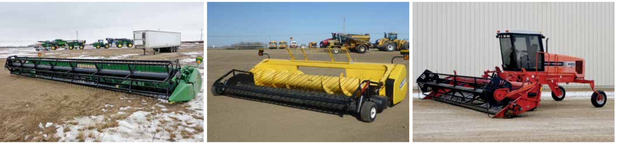
1 of 12 – John Deere 635F