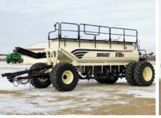
1 of 3 - 2013 Bourgault 6700ST