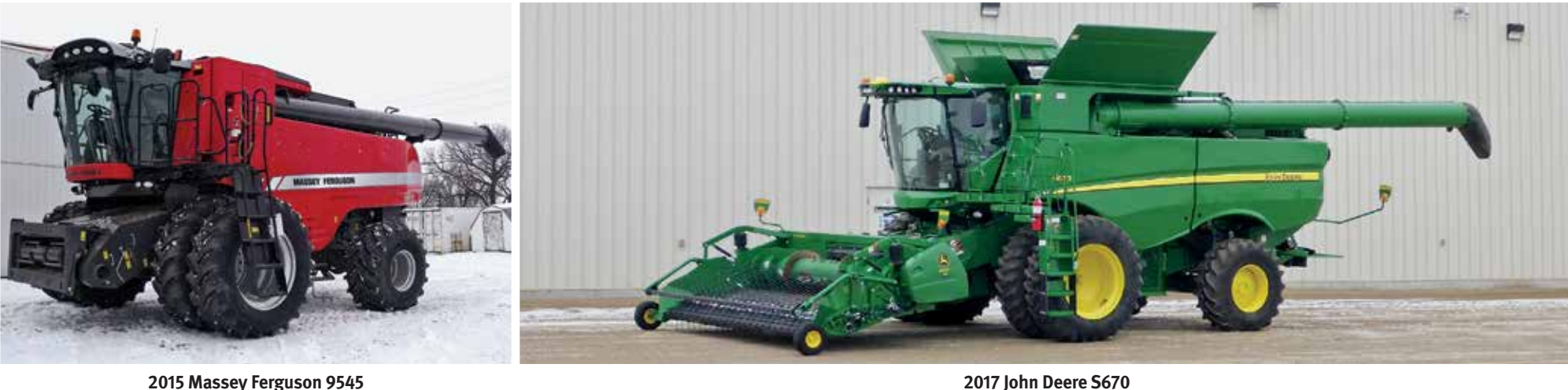
1 of 2 - 2013 Claas Lexion 670

Sign up for FREE digital brochures Get alerts for the newest brochures delivered right to your inbox www.rbauction.com/brochures