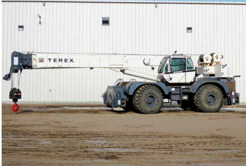
2012 Terex RT670 70 Ton