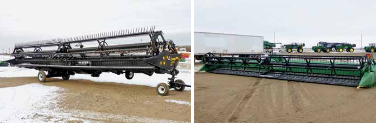
1 of 2 – 2018 Honey Bee AF240 40 Ft