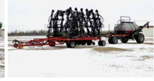
2010 Case IH PH800 50 Ft w/3380