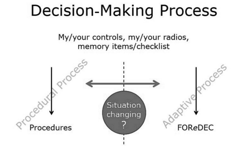
Figure 1. Decision-making process at Luxair.

result in ignoring the tool during critical situations in future. In order to overcome this limitation, the letter e ( experience ) was introduced to allow crews to exchange and share their experiences and solution approaches gained in the past concerning a particular situation. The aim here is not to simply follow an undefined gut feeling but first to enable crews to question a situation based on their intuition and second to make best use of experience and workable solutions that had been successfully applied in the past. The guiding question to read out is: "Have we seen this before?". The letter e is placed between the first and second part of the tool so as not to influence the preliminary phase of data collection and its analysis and to provide the possibility to speed up the process should there be a reasonable solution at hand. The character e is presented as a small letter to emphasize the importance of taking time for reflection during the current decision-making process. This step follows the same principles as discussed in the original model FOR-DEC by the hyphen and in the PRO FOR! DEC by the exclamation mark.