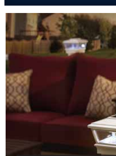
Dectorators White Solar LED Multi-fit Deck Post Cap Deckorators<sup>™</sup> Black Classic Balusters White CXT Classic Railing

Not just to see in the dark, but to create a space that feels safe inviting and exciting. Your place. For just you... or for all of you!