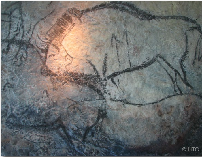
Paintings of bison (above) and an ibex (below) from the Salon Noir of Niaux cave