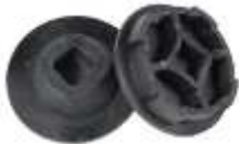
Plastic Valve Install Tool (min order qty 5)