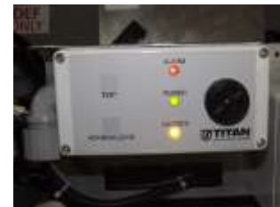
Audible Overfill Alarm