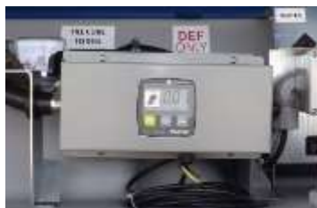
Pulse Meter Option