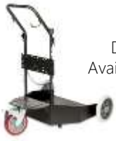
Drum Cart Available without Pump