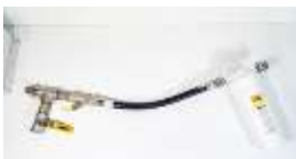
Hose Assembly w/ SS Ball Valves