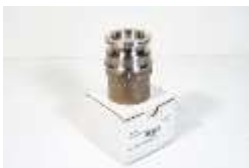
SS Emco Wheaton 2" Dry Break Male Coupler