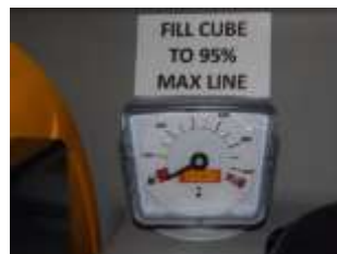
Liquid Level Gauge