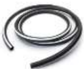
10 or 20 ft. hose