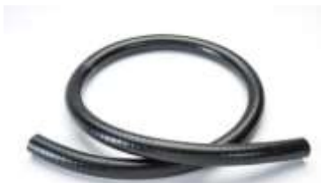
Titan 3/4' DEF Suction Hose – reinforced with helix wire to prevent collapsing. Like our dispense hose, it is designed for DEF applications.

Looking for a certain size? We can cut to specified lengths! Call us today!