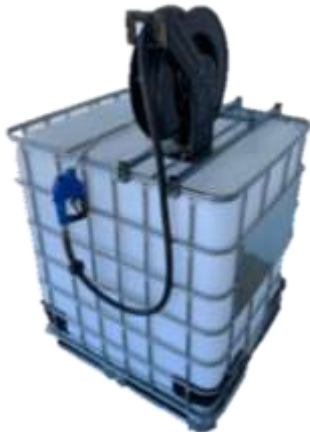
Hose Reel Tote Bracket (Hose reel, nozzle and tote not included.)