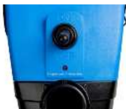
AC/DC Model Equipped with Built-In Timer

The Blue1 TED1 is the perfect and affordable solution for low volume shops and a better alternative to a manual hand pump when pumping from drums.