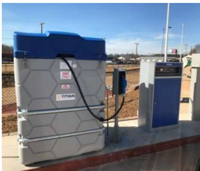
Island Ready Footprint