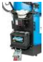
Battery Mount (battery not included)