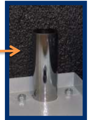
Temperature probe installed. Temperature control activated at 30°F

The Blue1 heated PDU is insulated and fitted with a 120 vac 475 watt heating system that is designed to prevent the DEF from freezing in minimum ambient conditions down to -40°F (-40°C).