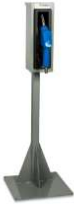
Carbon Steel Nozzle Holster (Nozzle not included)