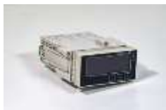
Level Gauge (Ria45)