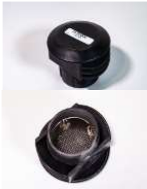
Atmospheric Vent used in Platinums