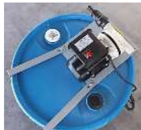
Drum Mounting Kit