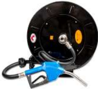
Hose Reel (available in 25 ft or 50 ft) (Nozzle not included)