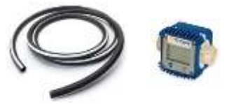
10 or 20 ft. hose Flow Meter