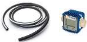
10 or 20 ft. hose