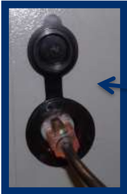
Standard 110V Power Receptacle