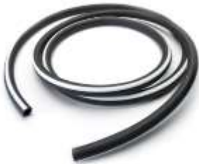
3/4" DEF Dispense Hose – designed specifically for dispensing DEF.