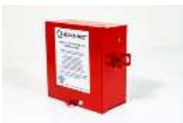
Veeder Root Isotrol Box