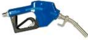
Auto Nozzle w/3/4" barbed swivel, nozzle hook Available without swivel and hook.