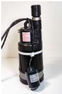
Submersible DEF Pump w/Float Switch ½ HP or 1 HP available