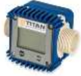
Turbine Flow Meter