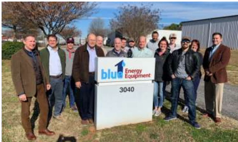
Blue1 Energy was recently presented with the DEF Industry Equipment Innovation Award at the 2019 Integer Conference held in Scottsdale, AZ.

We are proud to have some of the best and most recognizable fleets as customers. With our products installed at thousands of locations across North America, contact us today to find out how we can help you.