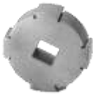
SS Valve Install Tool