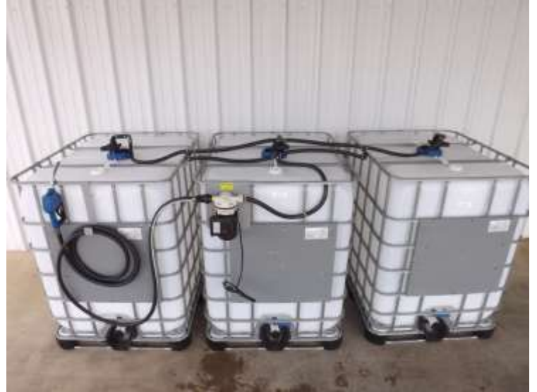
(Totes and Pump not included.)

The Blue1 Tote Manifold System) provides the end-user with a simple to install solution that links together totes in to a single pump suction point. No further need to move your pump around from tote to tote. The prepackaged kit comes assembled and ready to go after a few easy steps for installation. The manifold features a dual opening lid design with standardized 4-cam valves preinstalled for quick and easy refilling of each tote. The two hole cap replaces the current lid on your tote and is designed to incorporate your existing valve and coupler. Connect the manifold to the couplers and the pump and you're ready to dispense!