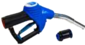
Misfill Prevention Nozzle w/Collar