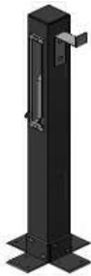
48" Tall Nozzle Stand Includes OPW Mis-fill prevention nozzle, swivel breakaway, 15' hose, nozzle cradle w/handle switch