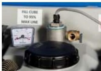
Internal Probe Heater