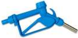
Plastic Nozzle w/locking pin, 3/4" barbed connection