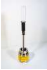
Stainless Steel Overfill Prevention Valve