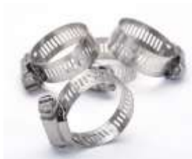
Stainless Steel Hose Clamps (min order qty 50)