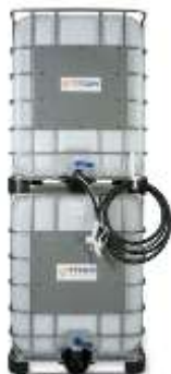
Gravity Feed System, DEF Hose, Manual Nozzle Available with 10 ft or 20 ft of dispense hose. (Totes and hose hanger not included.)