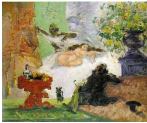
Paul Cézanne: A Modern Olympia

In contrast, artists who have made conceptual innovations have been motivated by the desire to communicate specific ideas or emotions. Their goals for a particular work can usually be stated precisely, before its production, either as a desired image or a desired process for the work’s execution. Conceptual artists consequently make detailed preparatory sketches of plans for their paintings. [11]