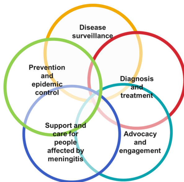
Fig. 3. The overlapping pillars to defeat meningitis

Links between the five pillars and the 19 strategic goals are set out under each pillar. GBS is singled out for some goals, as: (i) GBS has a particularly high incidence in newborn babies; (ii) GBS vaccines are in development but not yet available; (iii) knowledge of the disease burden and prevention strategies are less advanced than with respect to Nm, Spn and Hi, especially for low- and middle-income countries.