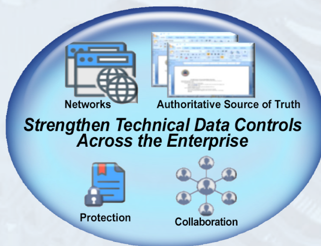
Figure 4. Technical Data Controls

disruption to supply chain operations. They are often times more difficult to detect and counter and can undermine confidence in the data or system in ways other disruptions do not. This initiative operationalizes DLA's deployment of layered cybersecurity activities to protect, defend and infuse resiliency into information technology systems. Maintaining a secure and resilient cyberspace operating environment and ensuring prioritized remediation of top cyber risks are essential components of this initiative. It also sets in motion an effort to explore strategic partnerships between DLA and US Transportation and Cyber Commands to provide integrated, secure supply chain solutions to DoD. The Global Supply Chain is as strong as its weakest link. Because of this, strategic alignment among these partners is critical to ensure cyber-secure transitions between DLA supply chain operations and USTRANSCOM mission sets.