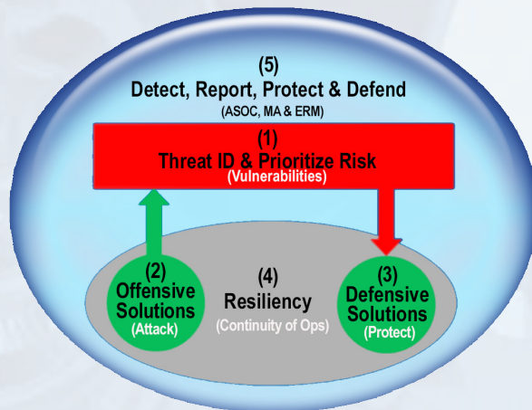
Figure 1. DLA's Supply Chain Security Architecture

What does a “secure” global supply chain look like? DLA's overall supply chain security strategy is designed to establish an architecture that comprehensively addresses supply chain security from an enterprise perspective. The architecture consists of five broad components. These components are depicted in Figure 1 and explained in the following 5 paragraphs: