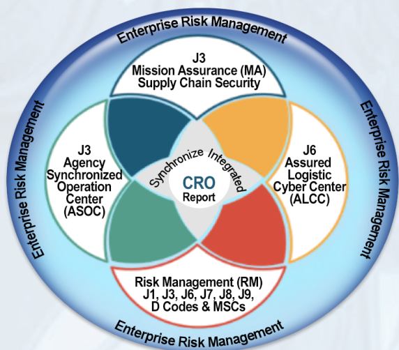
Figure 3. Enterprise Risk Management

This Strategic Focus Area also includes an initiative to finalize the development of the Agency's Resilient Supply Chain Operations Scorecard which will provide a "live" operational view of DLA's Supply Chain Security environment. The Scorecard includes DLA's primary supply chain components and 23 sub-elements and portrays them from an Agency, Major Subordinate Command and Regional Command perspective. This live-fed resource will be integrated into DLA's Enterprise Dashboard which will allow the Agency Synchronization and Operations Center to proactively prevent supply chain disruption through detection, protection and defense of DLA's Global Supply Chain. The initiative takes a phased approach to implementation by first (Phase I) developing the initial concept and business rules for its use. Phase II then incorporates existing feeds within the Enterprise Dashboard for an initial live-view and Phase III maps the remaining feeds and fully integrates the completed Scorecard into the Enterprise Dashboard.