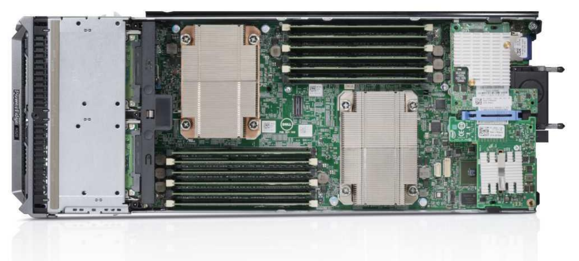
Figure 3. M520 internal module view

For additional system views, see the Dell PowerEdge M520 Systems Owner's Manual on Dell.com/Support/Manuals.