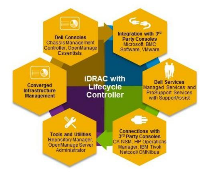
Figure 5. Dell systems management solutions

Dell systems management solutions include a wide variety of tools, products and services that enable you to leverage an existing systems management framework. As shown in Figure 5, Dell systems management solutions are centered on OpenManage server management, featuring iDRAC with Lifecycle Controller.