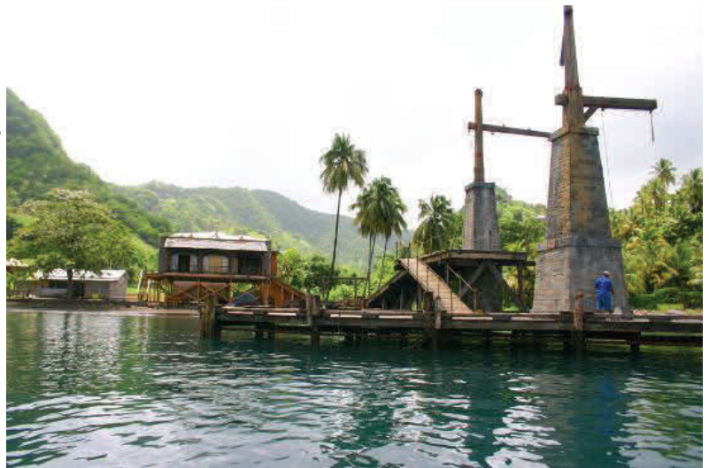
Pirates of the Caribbean Film Set, St. Vincent

Caribbean Based Food Competitions (Our own Caribbean Cake Wars, Face-Off etc.) We will seek to develop the potential of the Grenadine Islands and water scape of SVG in the area of film.