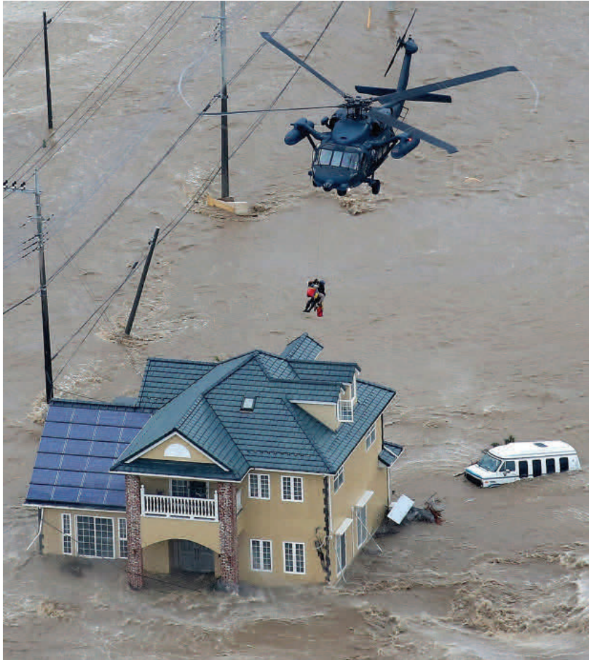
Helicopter Rescue of a man from his house roof after terrible floods in Japan in September, 2015

This is especially important for emergencies given the multi-island nature of the state of SVG and the current weather patters resulting in dangerous rainfall and floods to which we are prone.