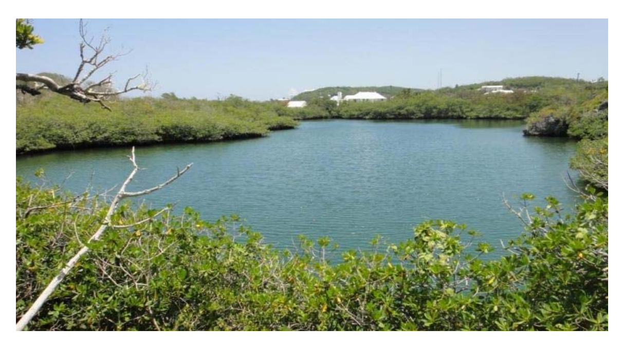
Figure 1: Walsingham Pond, Bermuda.

Walsingham Pond (see fig. 1) is an outstanding biological and geological treasure of Bermuda (Thomas, 2006). At 32°20'47"N and 64°42'34"W, the anchialine pond is one of the most studied sites in Bermuda (Wood and Jackson, 2005). The pond is located close to the ocean and has a very high flushing rate (Wood and Jackson, 2005). The salinity level is usually between 36-38 ppt and fluctuates tidally between 40-50 cm with an hour delay behind the local sea tides (Wood & Jackson, 2005). Walsingham is extremely productive biologically because the detritus from leaf litter washes into the pond from the land (Wood and Jackson, 2005). This provides the pond with a high level of nutrients that supports a diverse population of organisms' characteristic of the shallow sea (Thomas, 2006). These physical characteristics make the pond an exceptionally good location for filter feeding marine animals including clams, bryozoans, tunicates, sponges and tubeworms (Thomas, 2006).