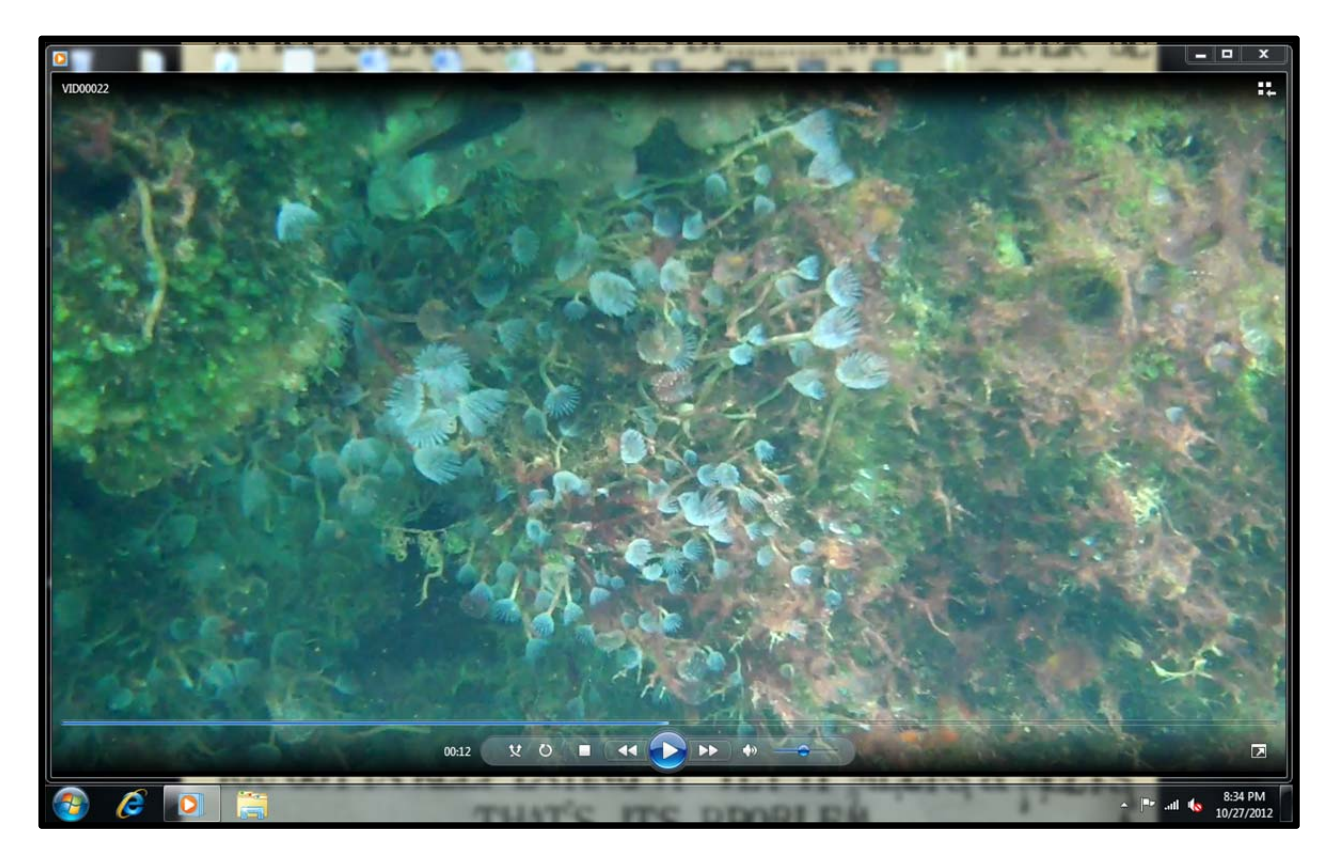
Figure 3: Example of a photo quadrat taken from video filmed with the Flip camera.

I entered Walsingham Pond with snorkeling gear, a Flip UltraHD video camera, and a two foot long measuring stick. I proceeded to snorkel around the perimeter of the pond in a clockwise direction randomly locating populations of Sabella melanostigma attached to mangrove roots and the faces of submerged rock walls. Each cluster of featherduster worms was approached slowly, and the two foot measuring stick was used as a reference to make sure each video was recorded from the same distance for each lot of worms. I had determined earlier that two feet was a desirable distance because the video would still be clear and the worms would not be startled by the observer and retreat into their tubes. A minimum of ten seconds was recorded at each group of worms from two feet away for a total of twenty five videos. The videos from the Flip camera were examined in Windows Media Player and one still frame shot was taken from each of the twenty five videos. Each still was taken at a point in the video where the recorder was absolutely still to ensure good picture quality and clarity. The result was twenty five photo quadrats to be analyzed (see fig.3).