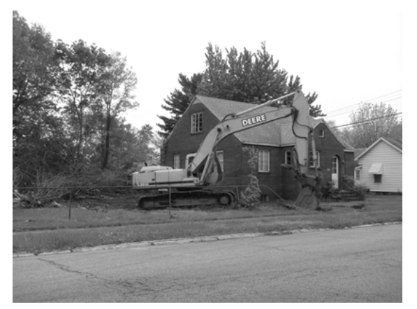
513 E. Broadway – Before