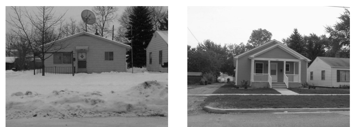
514 Grand – Before