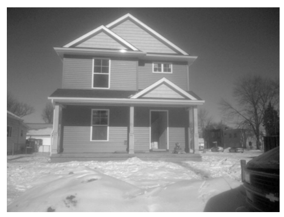
422 E. Grove - Current