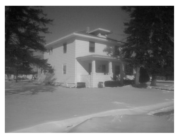
806 E. 10th - After