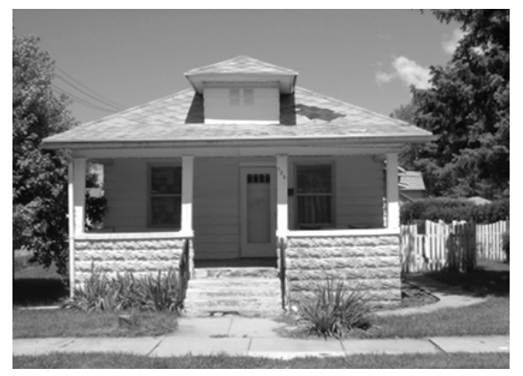
126 W. 10th – Before