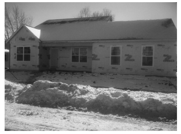
513 E. Broadway – Current