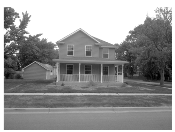
2604 Milburn – Current