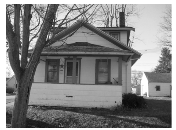
1923 Homewood - Before