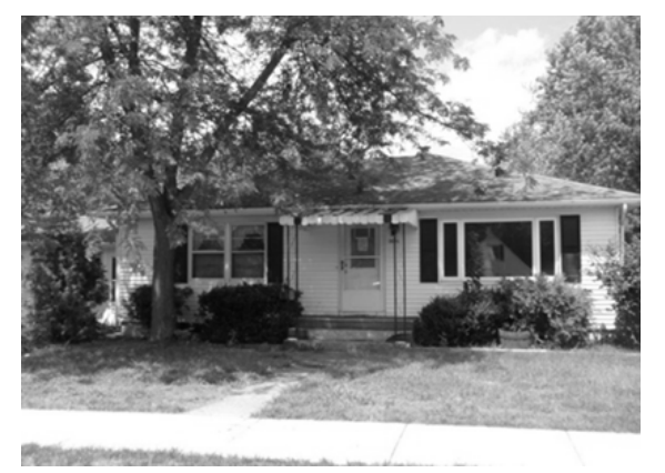
2604 Milburn – Before (meth house)