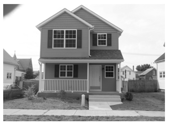
519 W. 6th – After