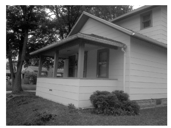
1923 Homewood - After