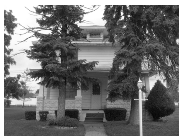
806 E. 10th - Before