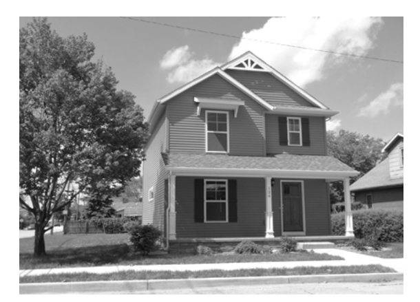
126 W. 10th – Current