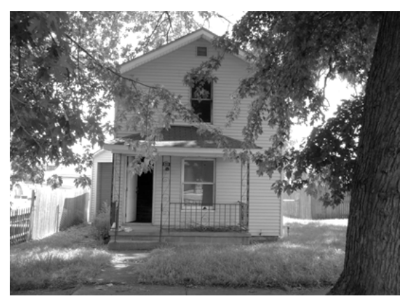
519 W. 6th – Before