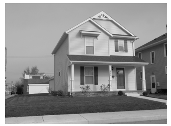
426 W. 9th – After