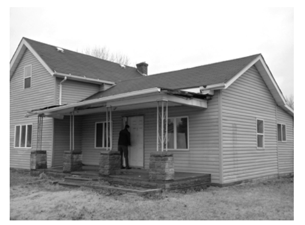
422 E. Grove – Before