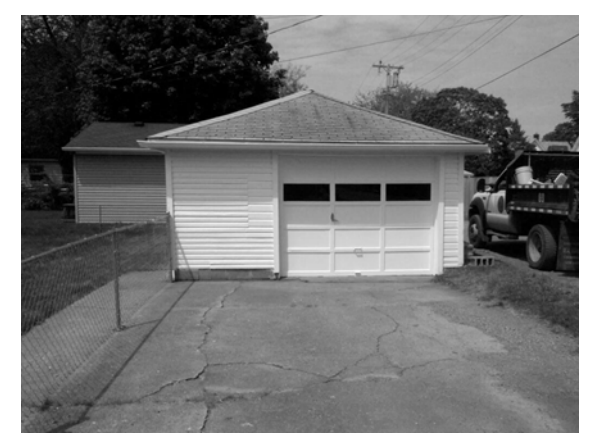
314 E. 8th - After