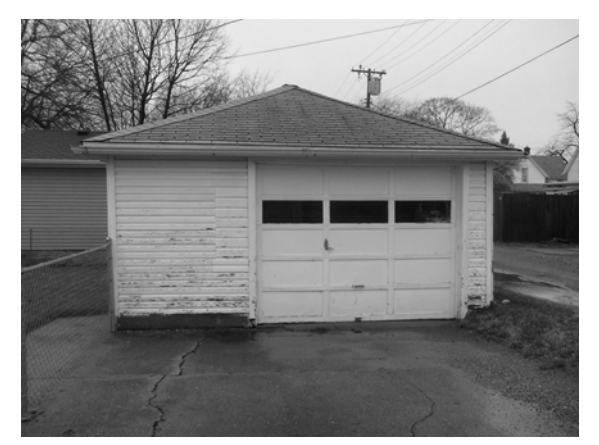
314 E. 8th - Before