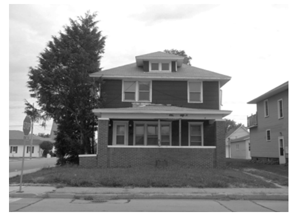
426 W. 9th – Before