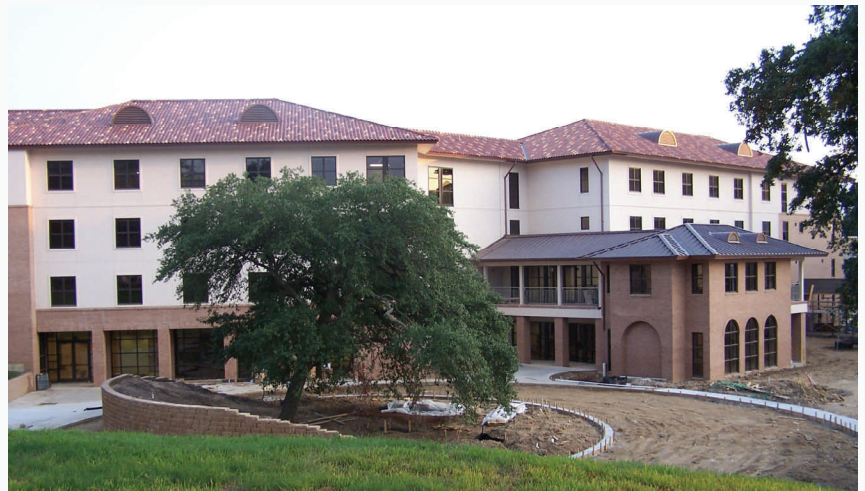
LSU's Engineering Residential College

LSU is implementing one of the oldest ideas in university education, residential colleges. Students may opt for lodging in a university residence with other students intending to study in the same college. For example, the Engineering Residential College is open to students declaring an engineering major or engineering undecided, and who enroll in college trigonometry or calculus courses. Incoming freshmen will be given preference for participation in the program as well as priority scheduling for certain courses. Onsite tutoring will be available as well as regularly scheduled academic advising with LSU College of Engineering counselors and faculty.