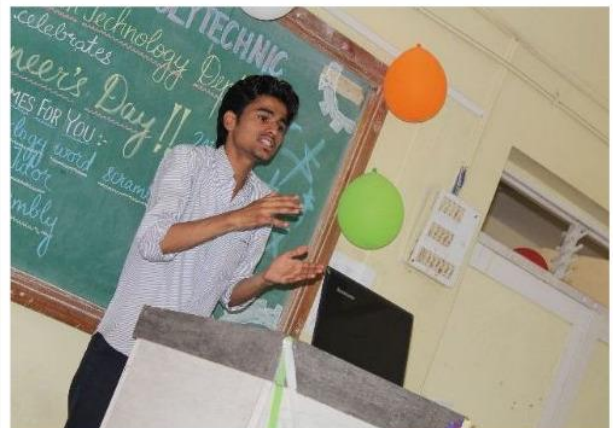
Student Speech on Engineers day