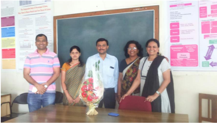
Students at laboratorial practical