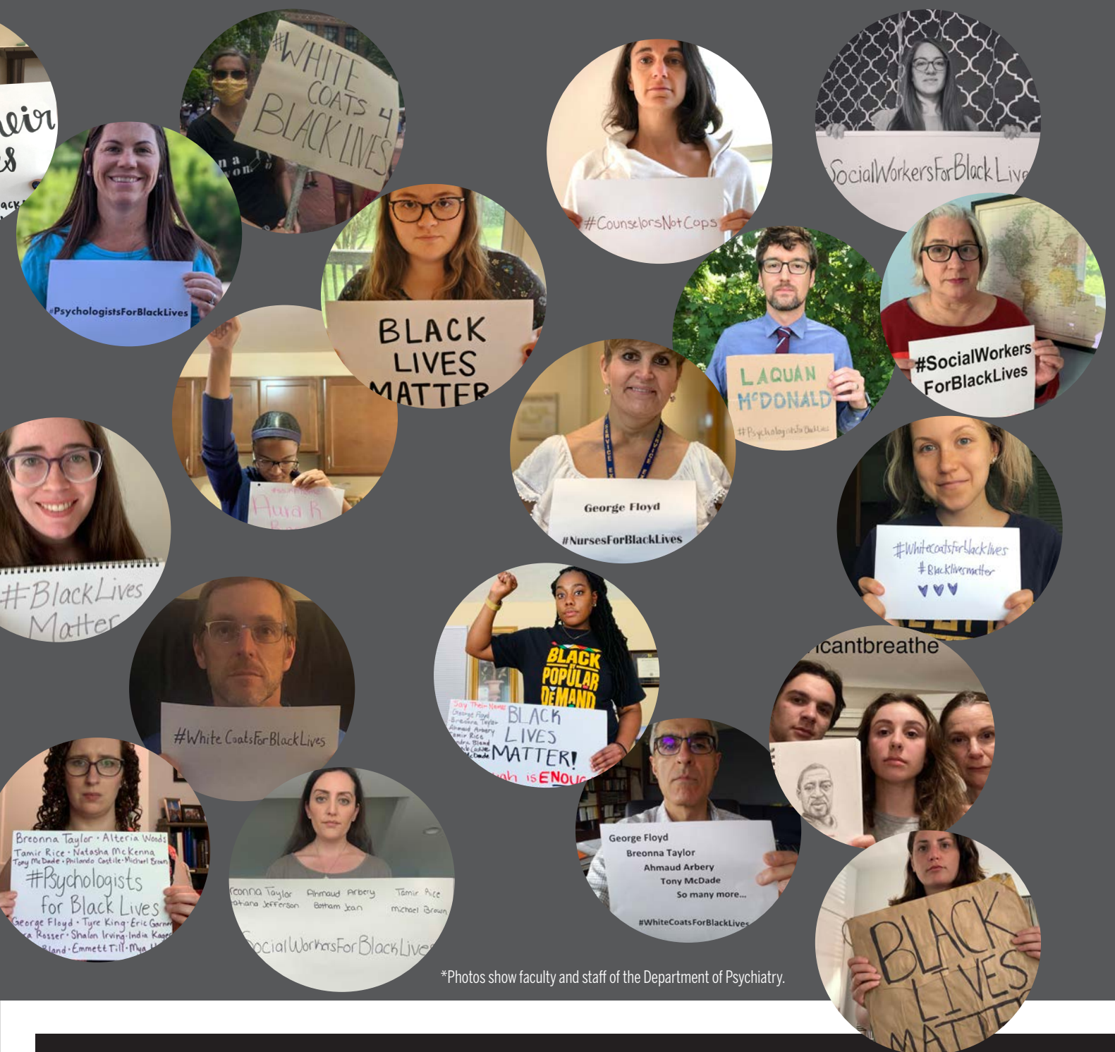
*Photos show faculty and staff of the Department of Psychiatry.