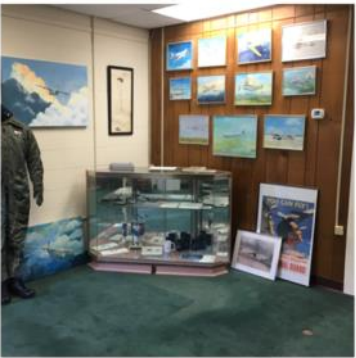
Submitted by: Kennard Wiggins, Curator, Delaware Military Museum