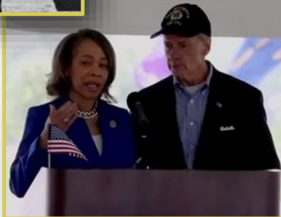
Congresswoman Blunt Rochester and Senator Carper attended the ceremony at the Veterans Memorial Cemetery in Bear.