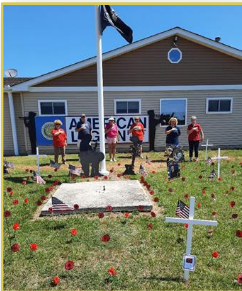
American Legion Auxiliary Unit 17 of Lewes Honors Our Lost Heroes Throughout Town