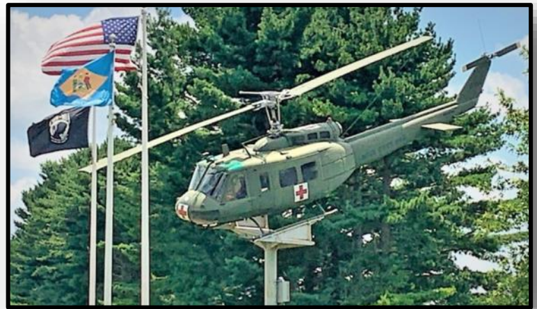
UH1 'Huey' at Dover Veterans Memorial Park