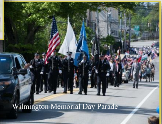
Wilmington Memorial Day Parade