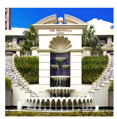
The Grand Fountain