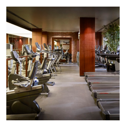
The Peninsula Fitness Center