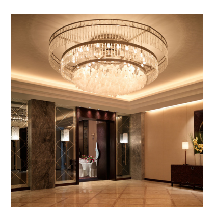
Rigodon Ballroom Foyer