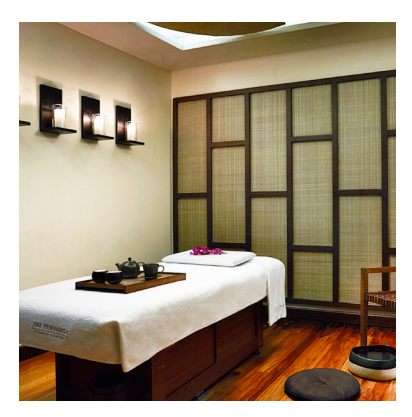
The Peninsula Spa Treatment Room