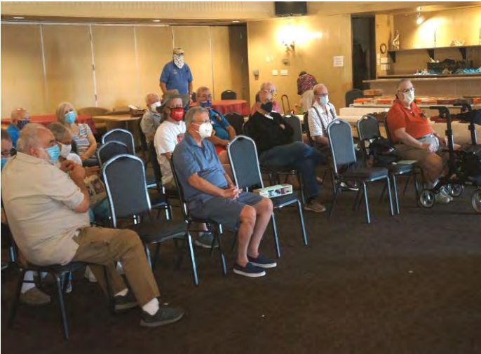
Members maintained proper distancing during the meet