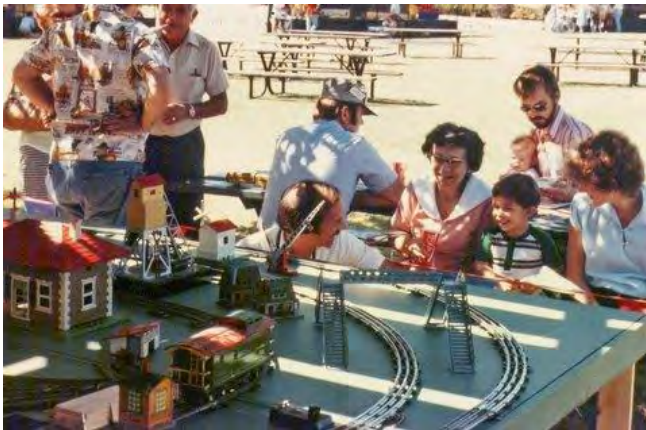
Rail Fair 1979

This should have been Rail Fair 2020 – I instead enjoy these pictures from years past