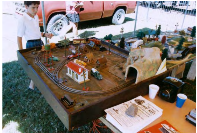
Rail Fair 1989