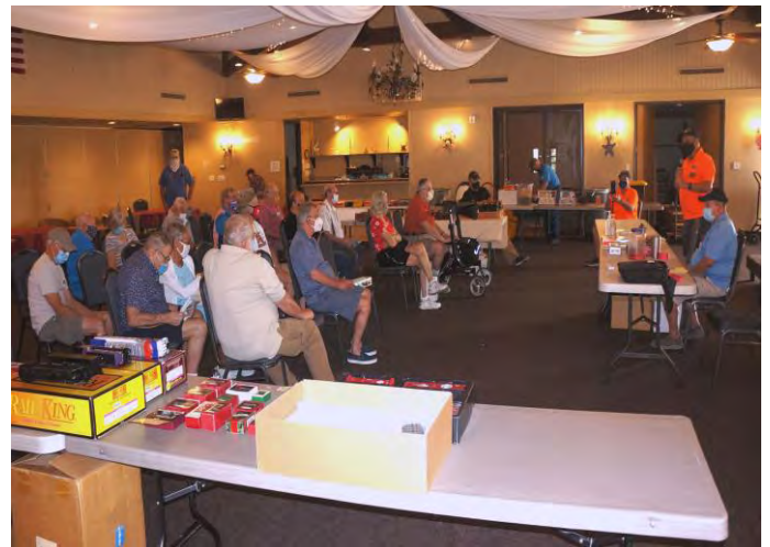
A view from the other side of the Elks Lodge Hall where we held the meeting. Very spacious and plenty of room to spread out.