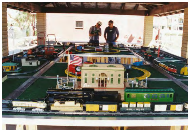
Rail Fair 1999