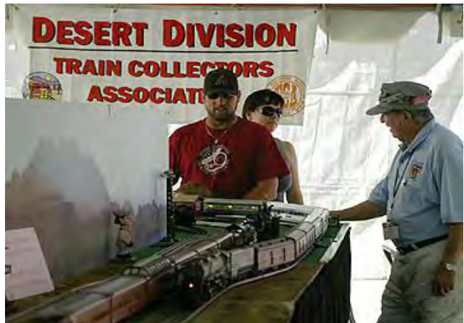
Rail Fair 2009