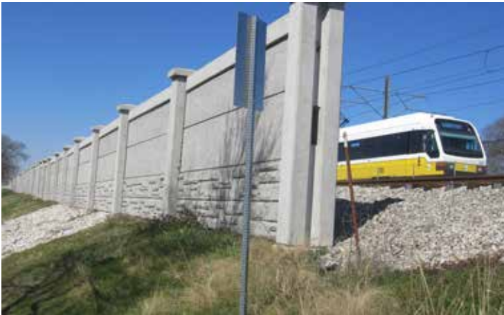
DART Blue Line, Garland, TX