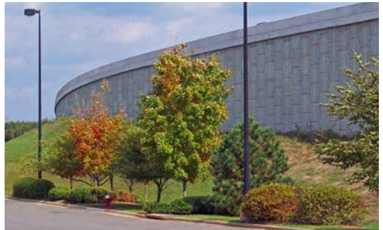
Route 28, Loudoun County, VA