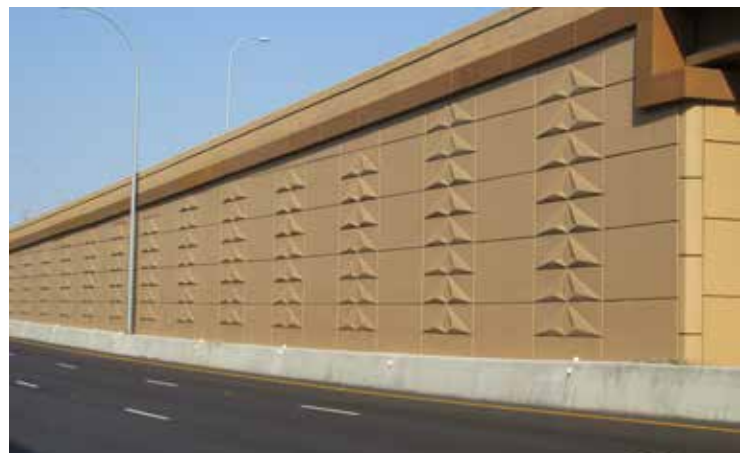
IH 635 Managed Lanes, Dallas, TX