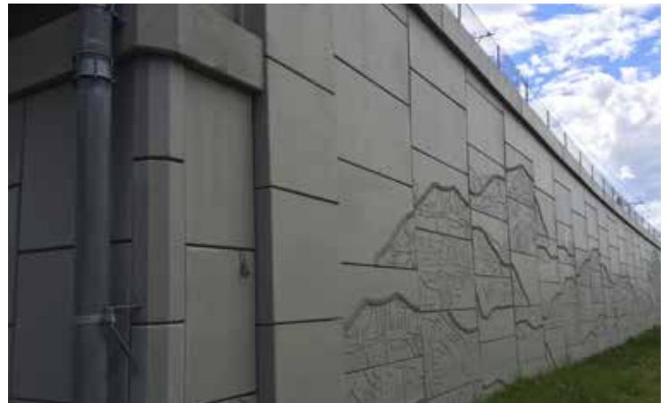
T-REX, Denver, CO