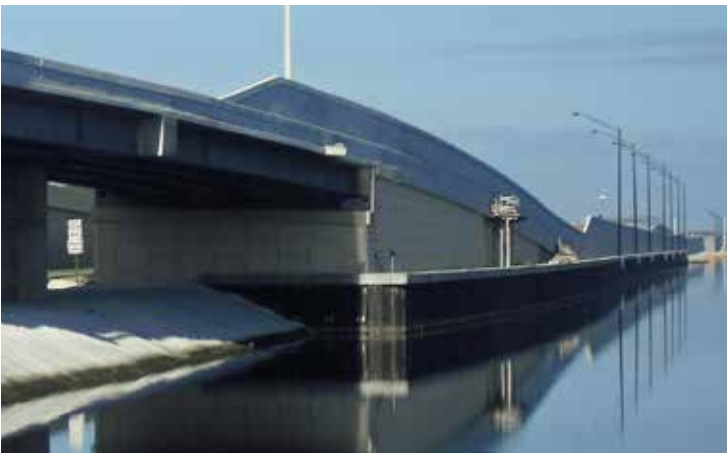
I-595 Expressway, Ft. Lauderdale, FL