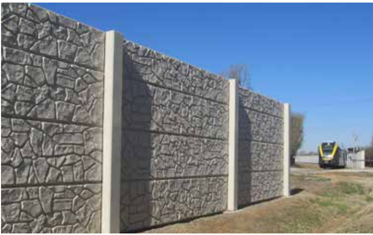
A-Train, Denton County, TX