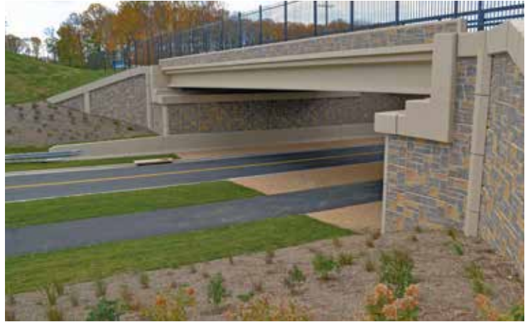
Route 123 over Campus Dr., Fairfax, VA