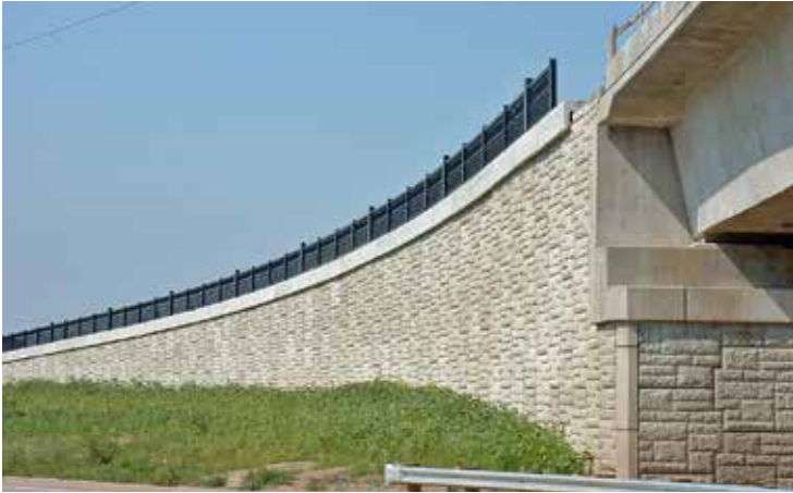
Hiawatha Light Rail Transit, Minneapolis, MN