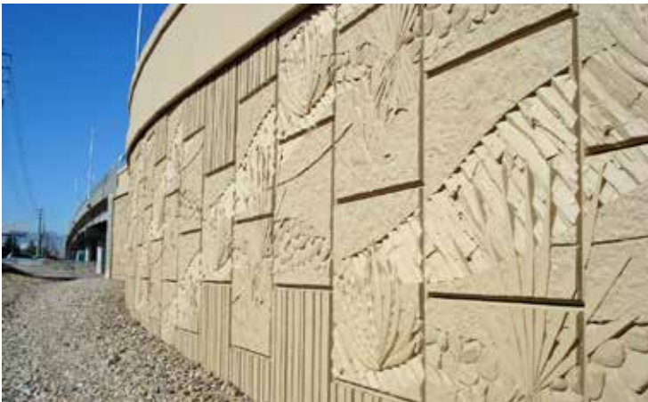
I-15 South Tropicana to Blue Diamond, Las Vegas, NV