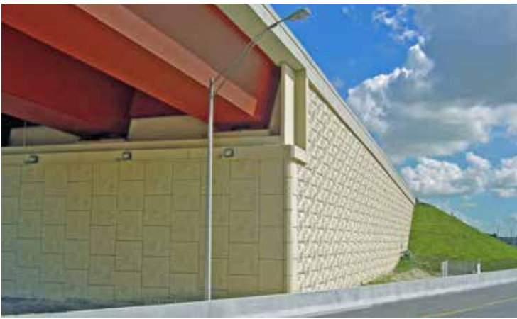
SR 836 Connection to SB HEFT, Miami, FL