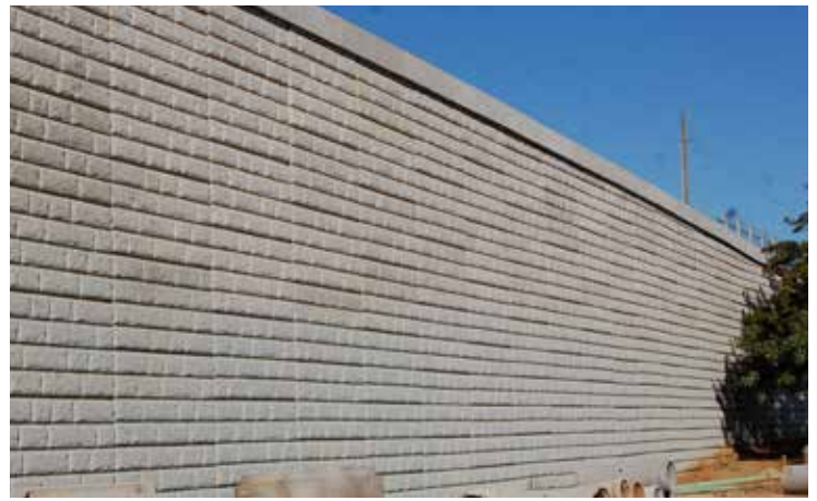
I-40/Smartfix, Knoxville, TN