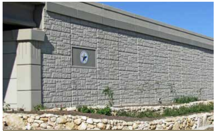
US 183A, Austin, TX