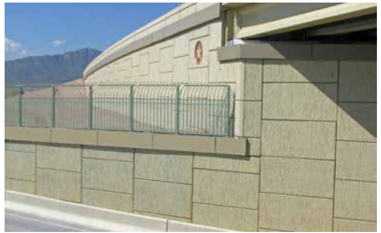
Spur 601, El Paso, TX