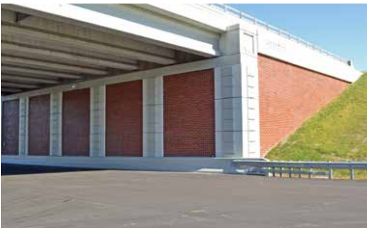
Triangle Expressway Toll Project, Raleigh, NC