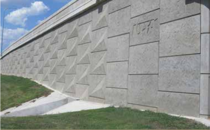
SH 161 Toll Road, Grand Prairie, TX