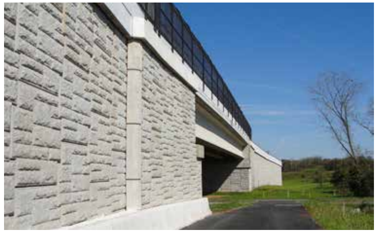
Pacific Boulevard, Loudoun County, VA