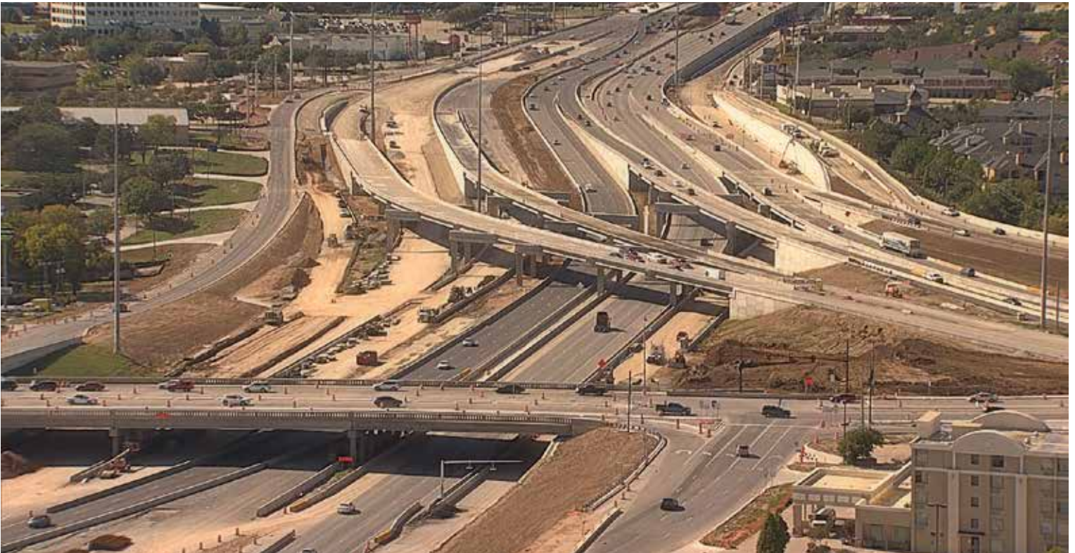
North Tarrant Express, North Richland Hills, TX

Manufactured materials are scheduled to arrive at the jobsite either just in time for installation or on a convenient schedule for onsite storage. A RECo project manager coordinates these material deliveries and assists with on-site construction advice. You will also receive our Construction and Quality Control Procedures Manual and our construction procedures video, Constructing Strength , for reference throughout the project.