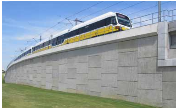
DART Orange Line, Irving, TX