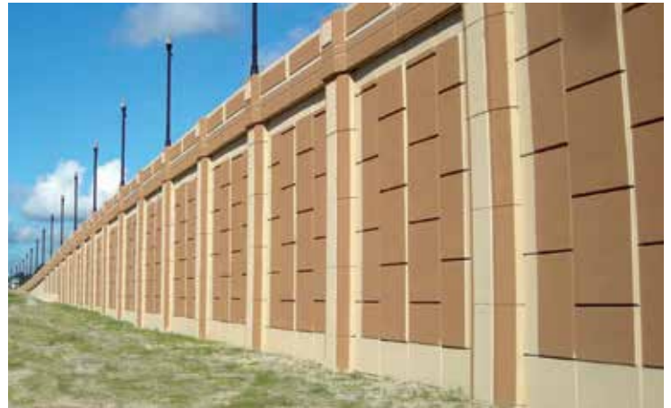
Johnnie Dodds Boulevard, Mt. Pleasant, SC