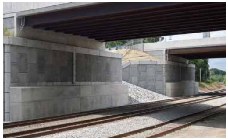
I-495 Design Build, Lowell, MA