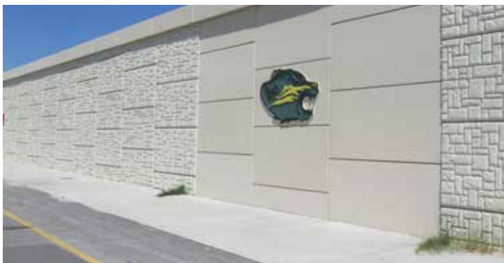
US 77 From Kingsville to Driscoll, Kingsville, TX