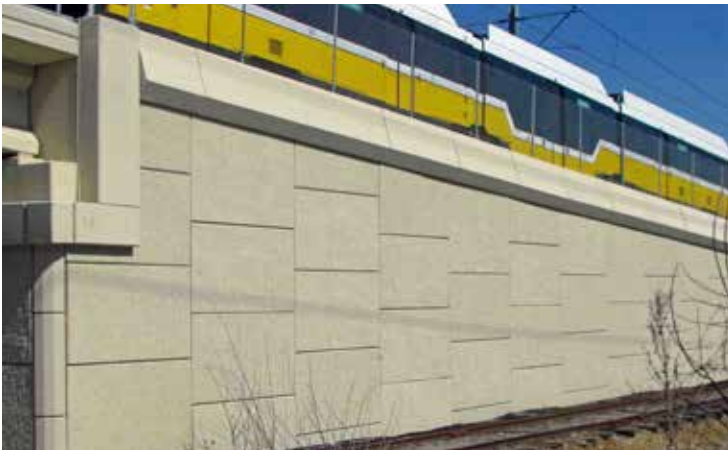
DART SE-1, SE-2 & NW-1B, Dallas, TX