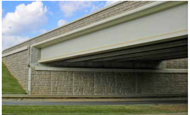
Intercounty Connector - Contract A, Montgomery County, MD