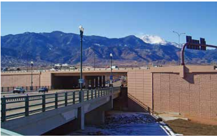
COSMIX, Colorado Springs, CO