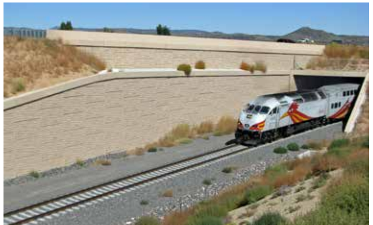
Rail Runner, Santa Fe, NM