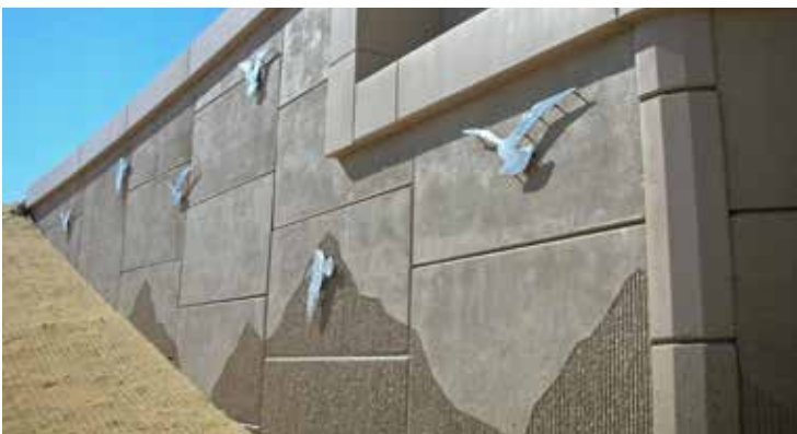
I-15 Beck Street, Salt Lake City, UT