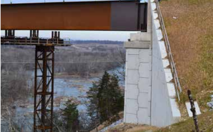
Shenandoah River Bridge, Harpers Ferry, WV