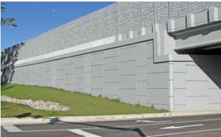
I-64, St. Louis, MO