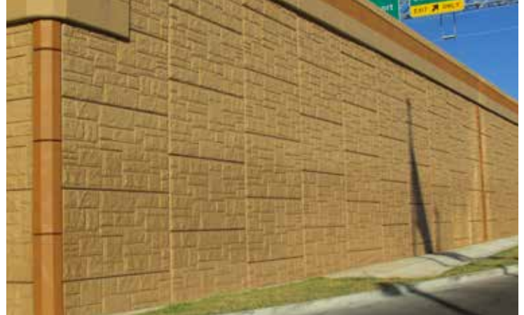
North Tarrant Express, North Richland Hills, TX