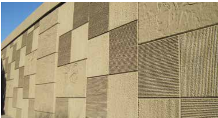
RTD West Corridor (Fastracks), Golden, CO