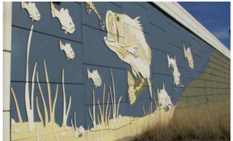
IH 35E Managed Lanes, Dallas & Denton, TX