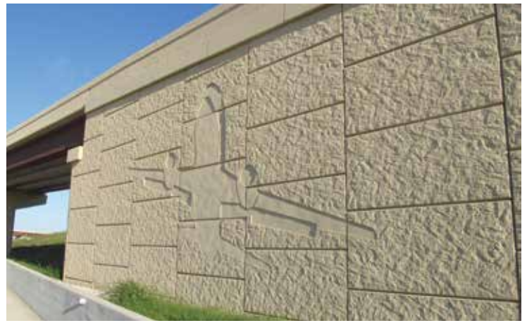
DFW Connector, Grapevine, TX