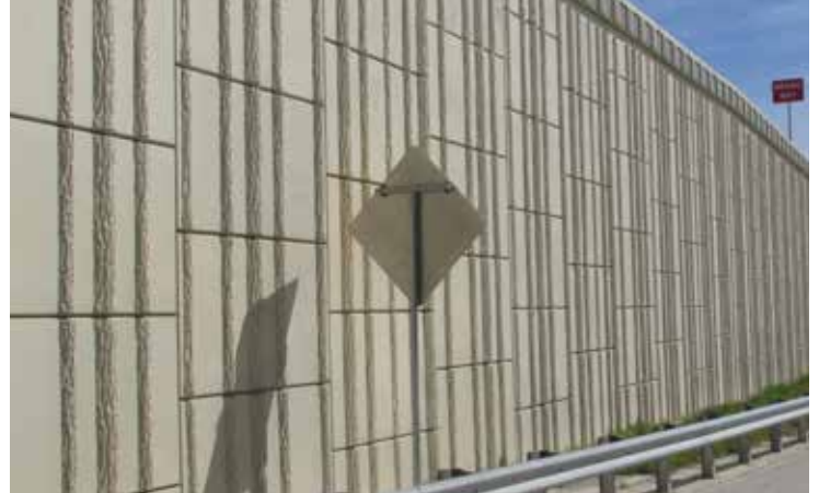
Grand Parkway, Houston, TX