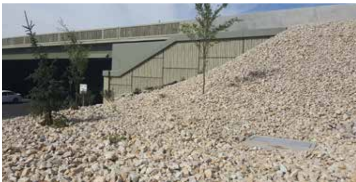
I-15 South Davis, West Bountiful, UT