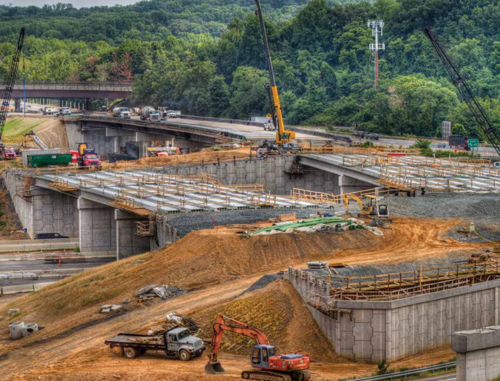
I-495 H.O.T. Lanes, Fairfax County, VA Cover Photo: The Dallas Horseshoe, Dallas, TX