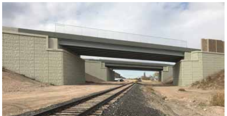
Mountain View Corridor, 5400 South to 4100 South, West Valley City, UT