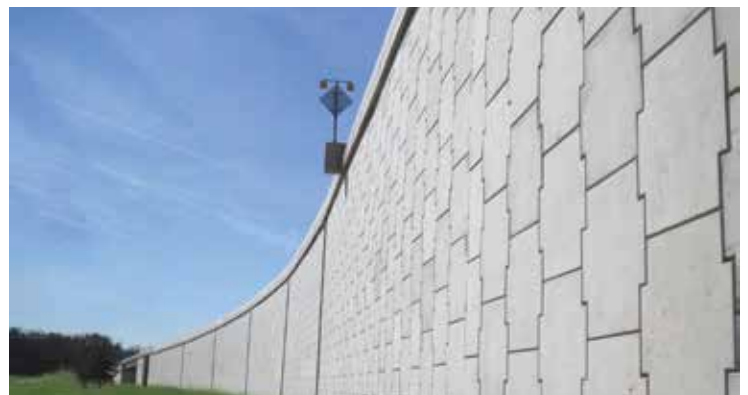
Richmond Airport Connector, Richmond, VA