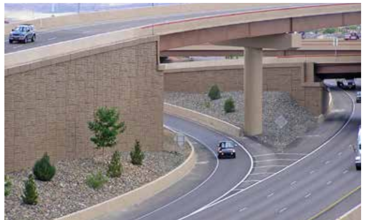
Coors Interchange, Albuquerque, NM