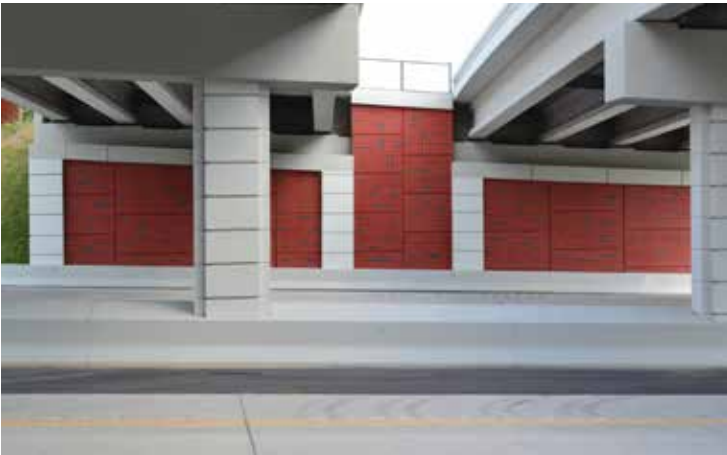
Western Wake Freeway, Morrisville, NC