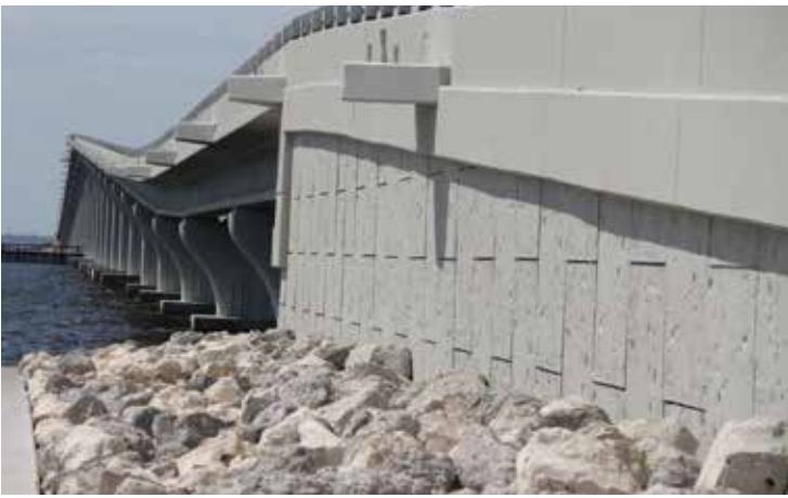
Courtney Campbell Pedestrian Bridge SR 60, Tampa Bay, FL