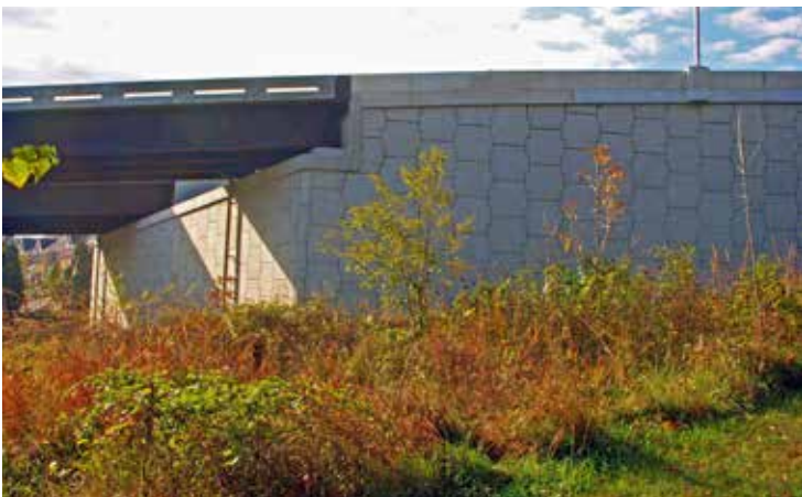
Battlefield Parkway, Leesburg, VA