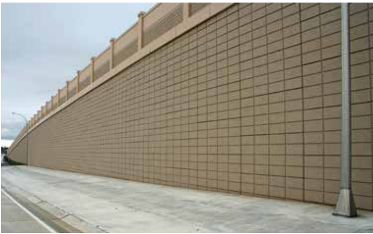
ROC 52, Rochester, MN