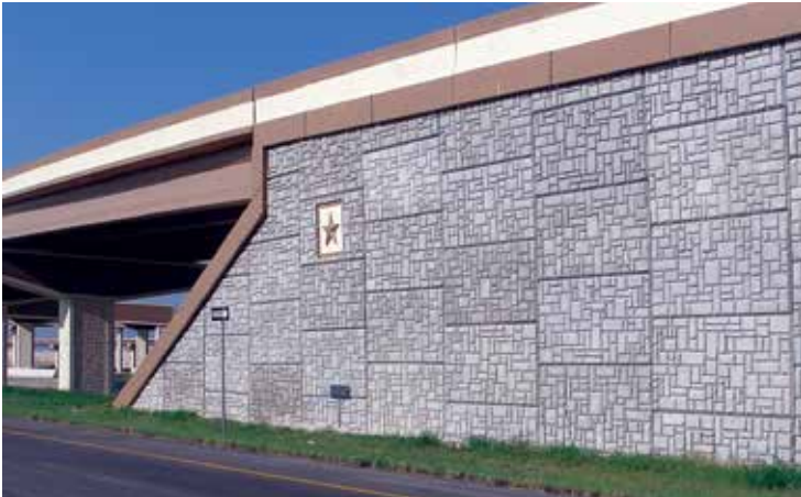
SH130 Austin, Pflugerville, TX