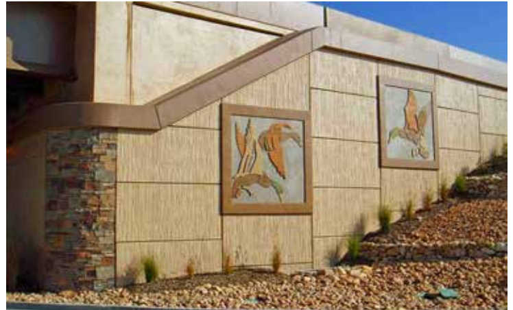
SR-201, Salt Lake City, UT