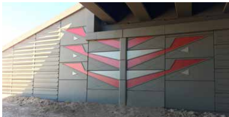
SR202L South Mountain Freeway, Phoenix, AZ