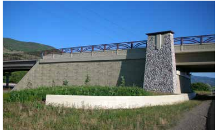
Legacy Parkway, Salt Lake City, UT