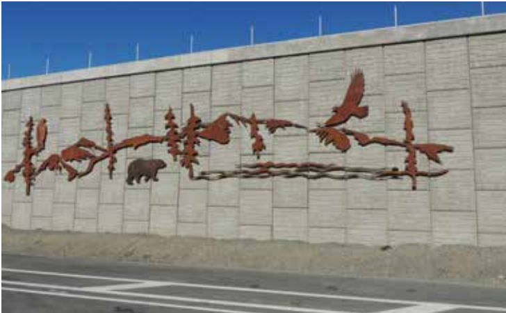
Glenn Highway Improvements, Anchorage, AK