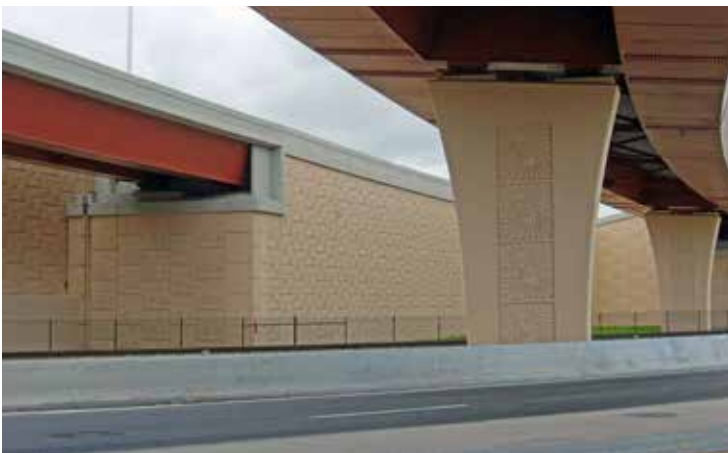
SR 836 Extension, Miami, FL