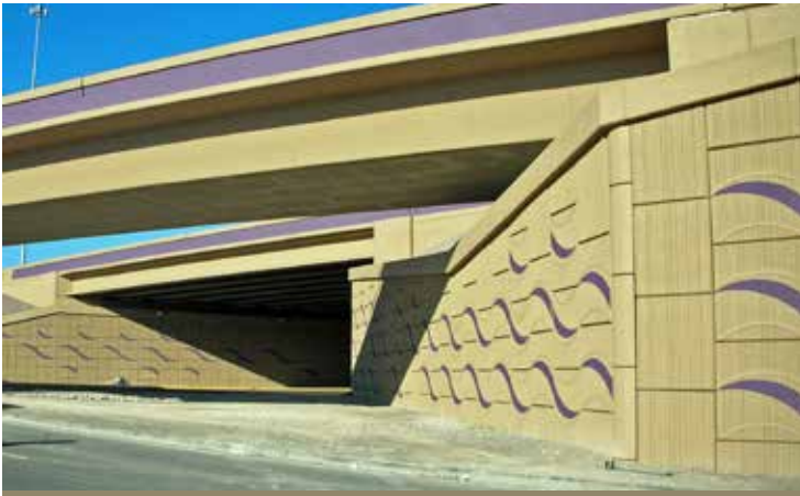
I-15 North Corridor, Las Vegas, NV